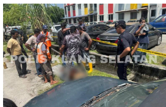
May 12, 2026 @ 9:49pm Man's body found in drain, heart attack suspected