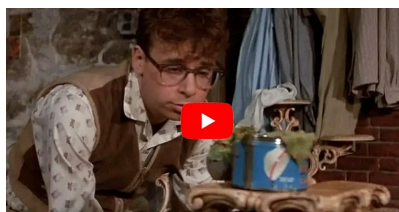
ZESTRADAR This Carnivorous Plant Terrified '80s Movie Theaters