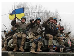
Ukraine latest: Ukrainian forces retake northern