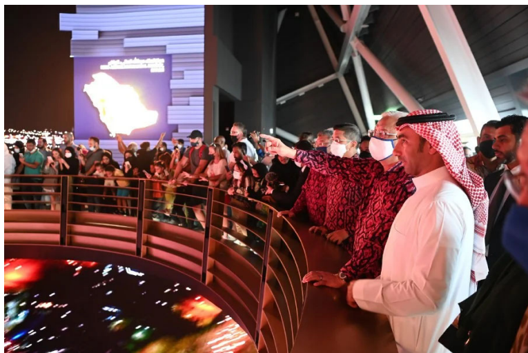
Prime Minister Datuk Seri Ismail Sabri Yaakob visiting the Dubai Expo.

By Dzulkifli Abdul Razak - March 31, 2022 @ 7:12pm