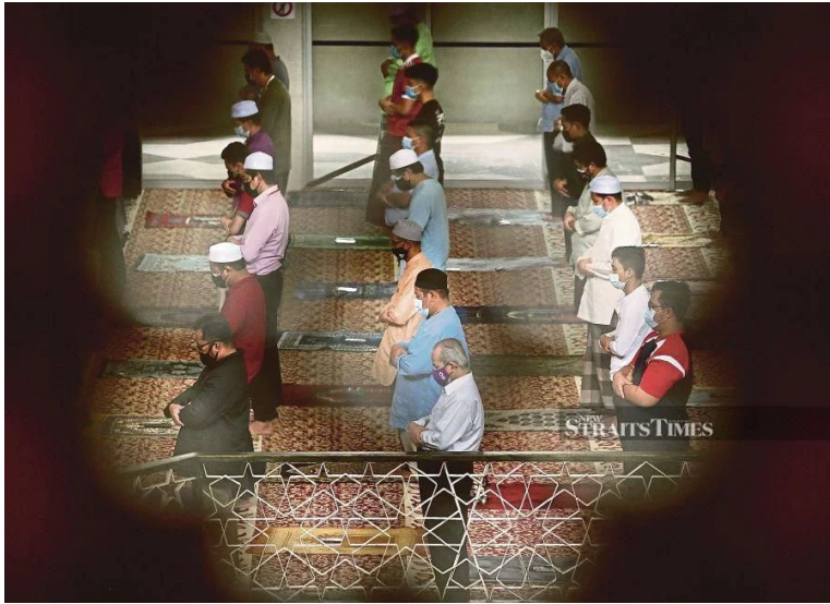
-NSTP file pic, for illustration purpose only.

By Thameem Ushama - December 10, 2021 @ 9:25pm