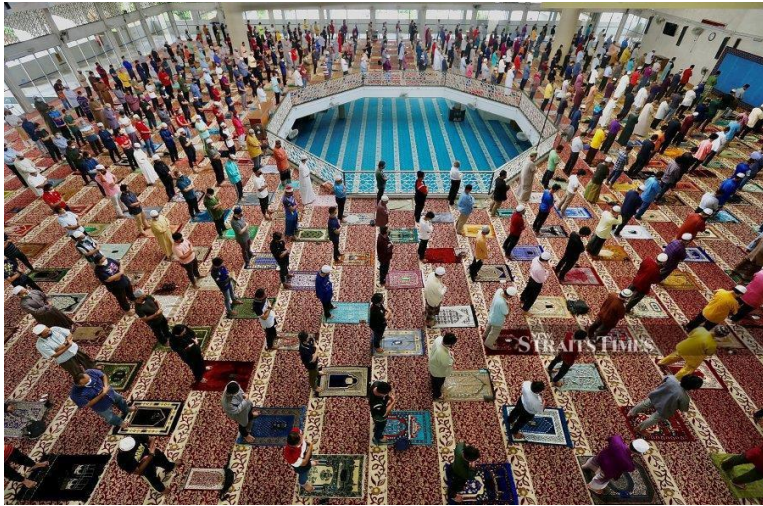
Islam is a unique and universal way of life. It is not for a clan or tribe, race, group or ethnic entity. - NSTP file pic

By Thameem Ushama - November 23, 2021 @ 9:25pm