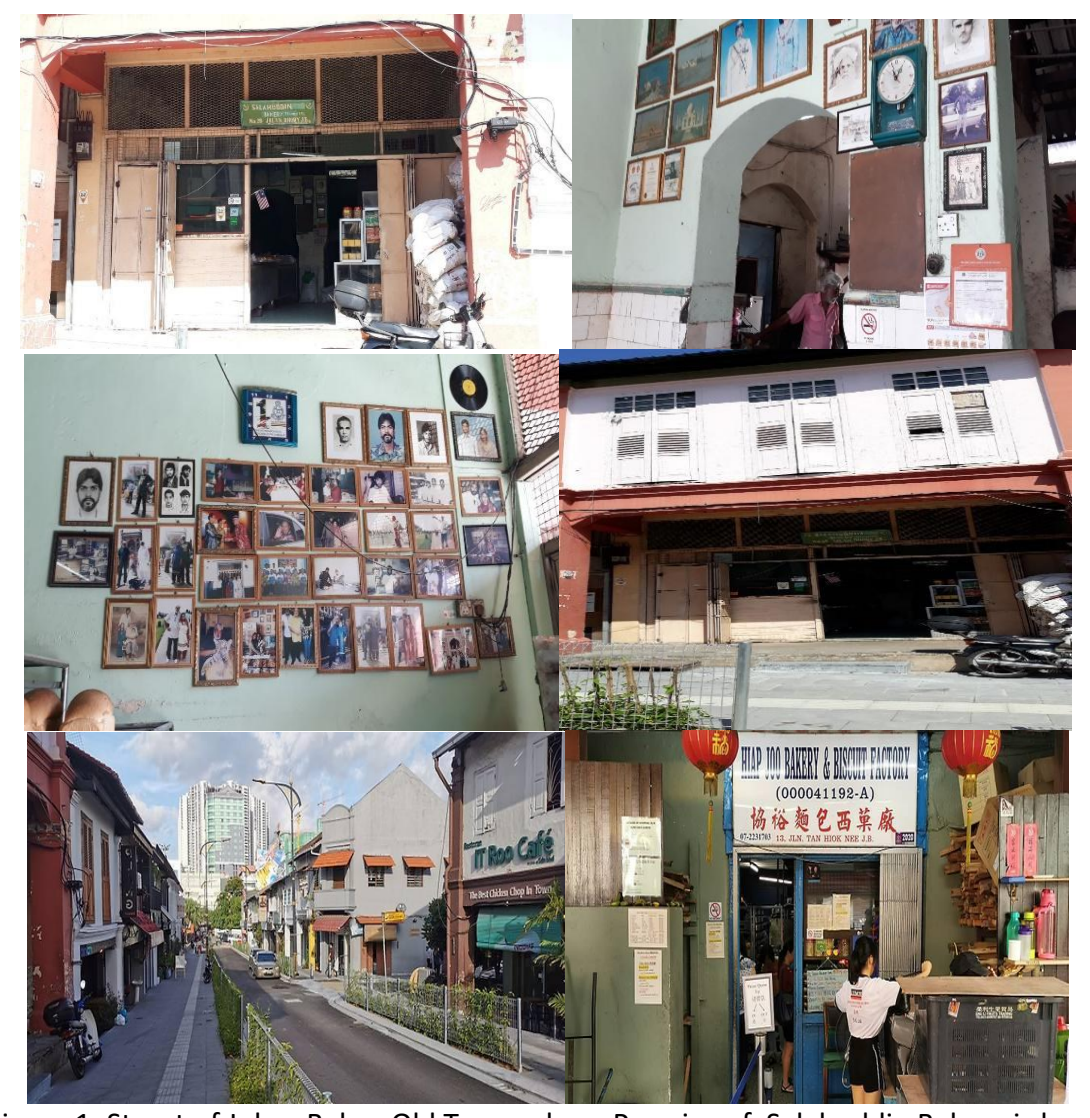
Figure 1: Street of Johor Bahru Old Town where Premise of Salahuddin Bakery is located

Vol. 11, No. 16, Contemporary Issues in Tourism and Hospitality industry, 2021, E-ISSN: 2222-6990 © 2021 HRMARS