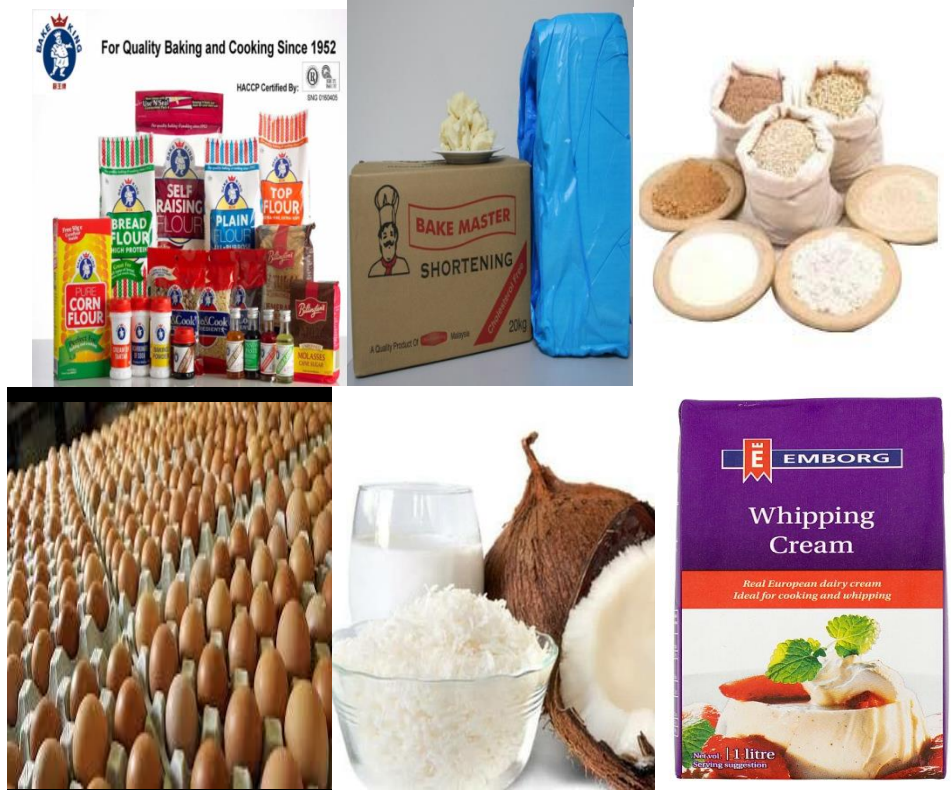
Figure 4. Types of raw materials used.

Vol. 11, No. 16, Contemporary Issues in Tourism and Hospitality industry, 2021, E-ISSN: 2222-6990 © 2021 HRMARS