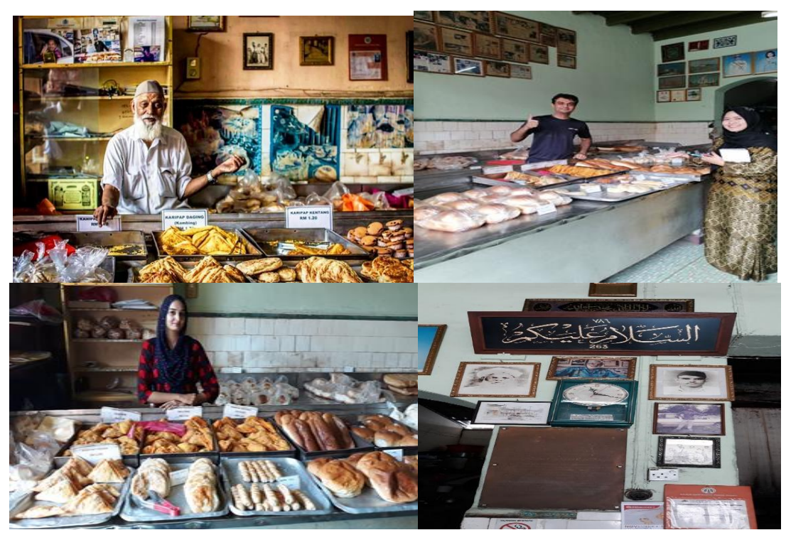
Figure 6. The owner takes turns with his son and daughter in managing the store.