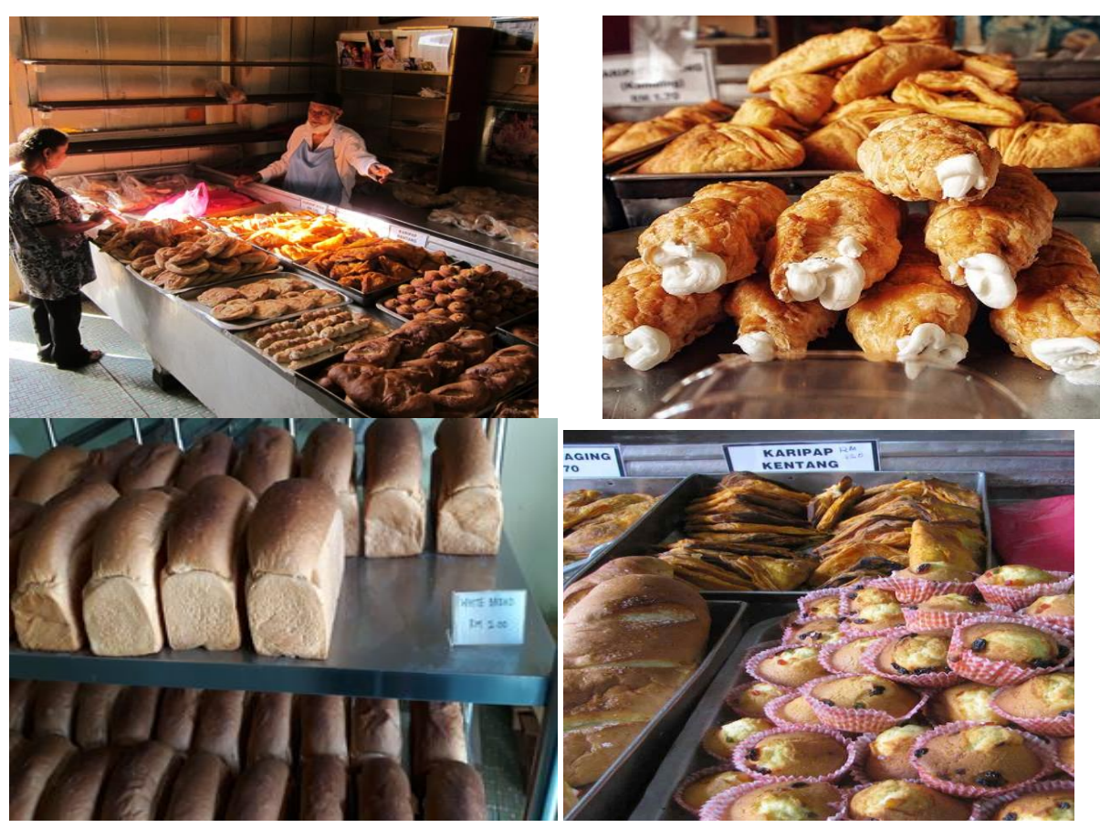
Figure 2. The various product ranges and how they are arranged.

puff pastry shaped like a horn filled with white cream. Figure 2 shows various bread and pastries being laid out on the table for the customers to select and purchase.