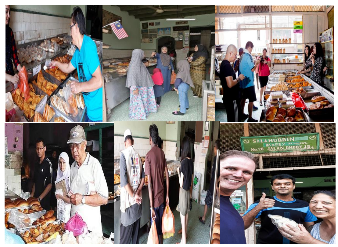
Figure 5. Some of the regular customers at Salahuddin Bakery.

Vol. 11, No. 16, Contemporary Issues in Tourism and Hospitality industry, 2021, E-ISSN: 2222-6990 © 2021 HRMARS