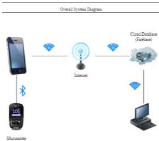
Fig. 4: Glucorio System Architecture

1) Overall system: An overall system diagram is shown in Fig. 4 gives a clearer view of how the tools, Accu-Chek Guide glucometer and Android smartphone, are connected to each other and how the system works.