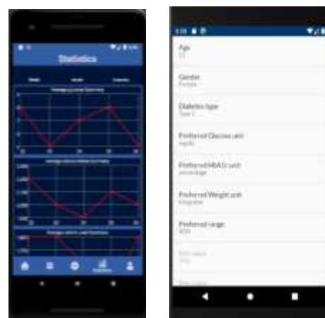
Fig. 7: Graph view page (left), Patient information page (right).