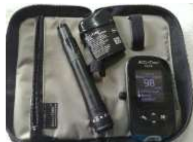
Fig. 3: Accu-Chek Guide Glucometer device

Hardware: Accu-Chek Guide glucometer (as shown in Fig. 3) and Android Smartphone to install APK Glucorio.