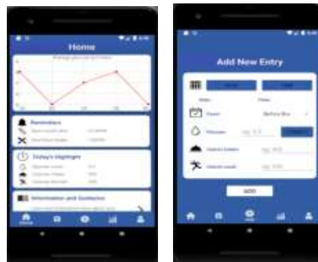
Fig. 6: Main page (left), Patient new entry page (right).