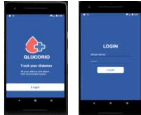
Fig. 5: Main Login page (left), Login page for patient (right).

clicking the patient's name. Next, the doctor can view all the recorded data of the patient in the logbook tab. The doctor can also analyse and monitor patient data in the graph tab. Fig. 5-7 show some of the interfaces in the Glucorio app.