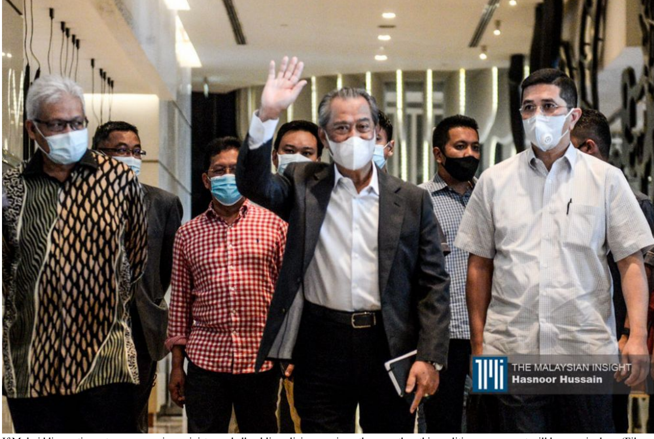
If Muhyiddin continues to serve as prime minister and all public policies remain as they are, then this coalition government will be meaningless.

[Liu Zhewei Column] The coalition government does not work in actual politics | The Malaysian Insight