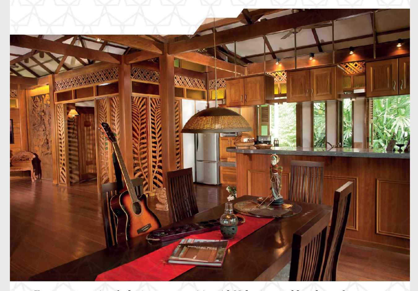
Your go-to consociate for business opportunities with Malaysian wood-based manufacturers