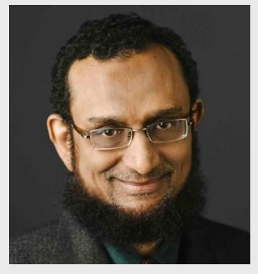
on hydrogen for Singapore.

Abstract: Carbon capture and fixation via microbes is a potential pathway for carbon utilization to address the global issues of decarbonization and climate change. Methanococcus maripaludis S2 , a fastgrowing autotrophic methanogen, is an attractive microbe that can convert CO<sub>2</sub> and renewable H<sub>2</sub> into a useful fuel methane (CH<sub>4</sub>) as a necessary energy-producing component of its metabolism. This talk will summarize our work over the last few years on exploring and understanding this metabolism. We constructed iMM518, the first axenic genome-scale metabolic model for M. maripaludis S2 and validated it with experimental data. This helped us elucidate quantify the impacts of nitrogen source (ammonia and dinitrogen) on the rates of CO<sub>2</sub> fixation and methane generation. Then, to enhance our understanding further, we were the first to examine the aqueous phase of its growth culture, which has surprisingly been neglected in the literature so far. Our work has shown the first experimental evidence of the acetate switch in any autotroph so far, which is well established in several heterotrophs (e.g. Escherichia coli ). This and other investigations have helped us identify new genes and enzymes and improve the rigor of our genome-scale model.