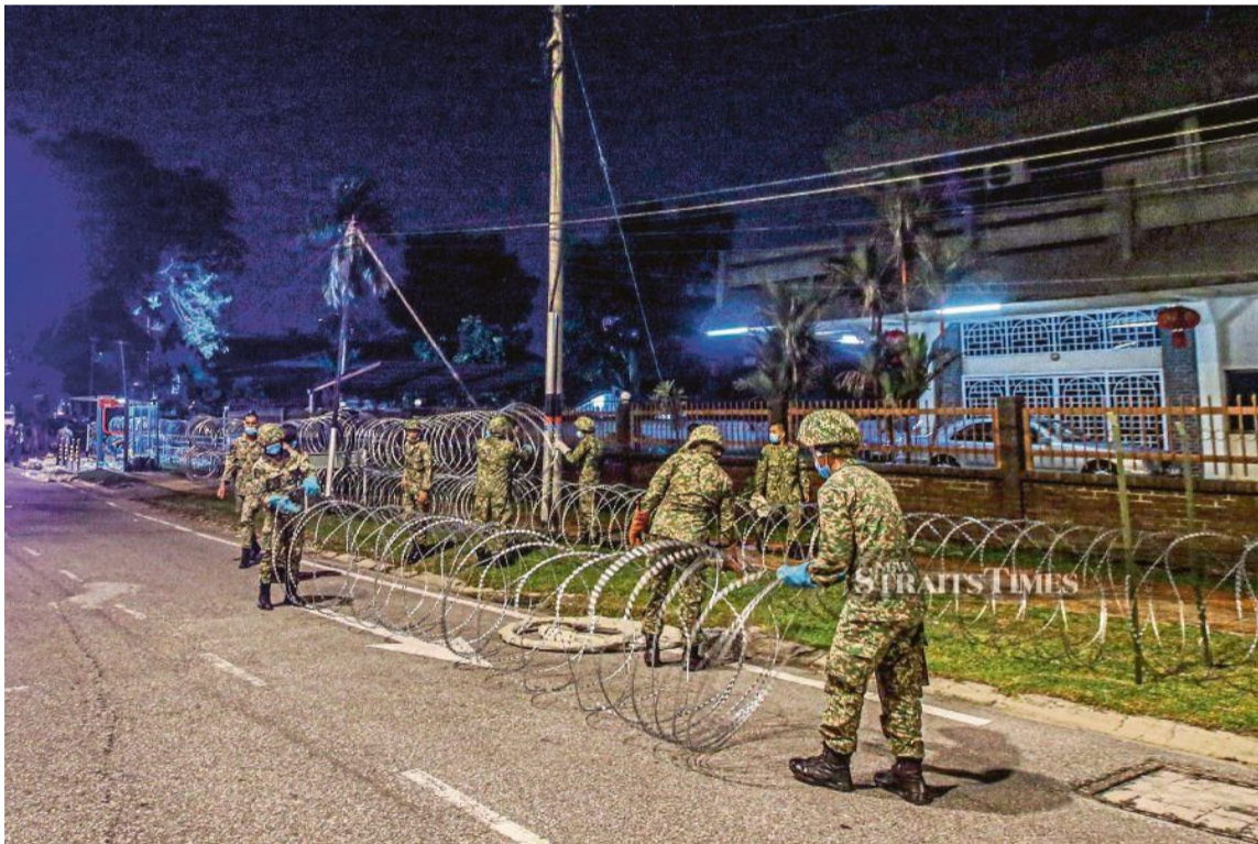
Soldiers putting up barbed wire along Jalan Pencala in Seksyen 4, Petaling Jaya, yesterday. The area has been placed under the Enhanced

THE nation has undergone almost two months of varying degrees of mobility restriction.