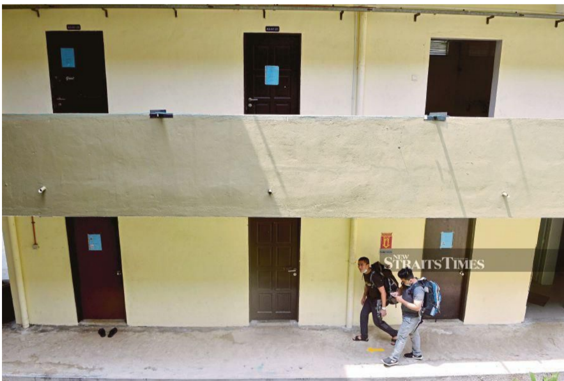
University students were caught in a limbo when they were forced to stay on campus unexpectedly.

Man falls to his death from third floor Suria KLCC shopping mall