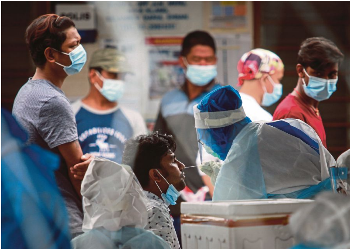
A Health Ministry worker carrying out a swab test on a foreign worker on Saturday in Meru, Klang. Human lives must take precedence, and not compromised in the search for power and profits.