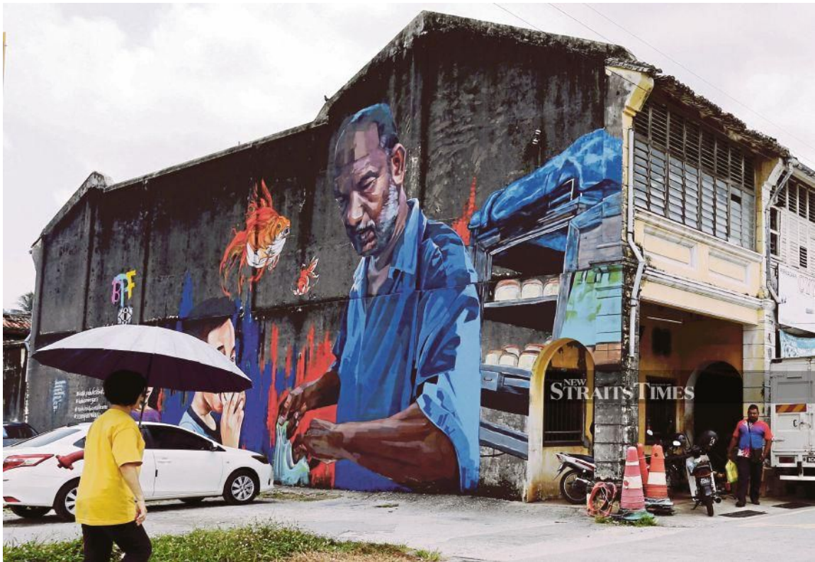
Murals of local Malaysian personalities, like that of a local bread seller in George Town, can be used to decorate restaurants.

By Dzulkifli Abdul Razak - January 14, 2021 @ 1:22am