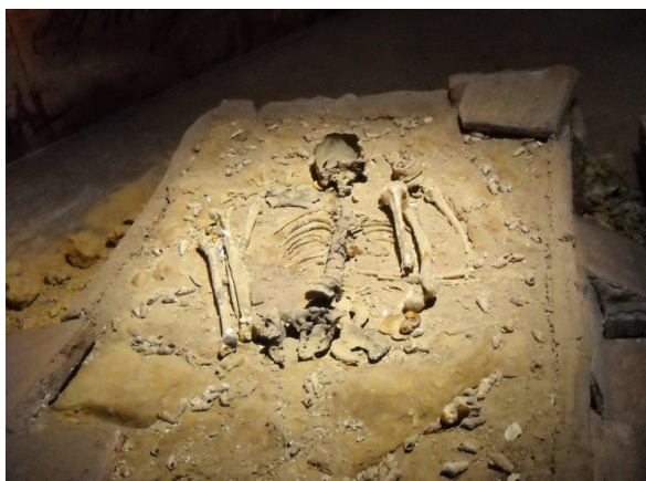
Figure 1. Perak Man skeleton, exhibited in the Lenggong Archaeological Gallery, Perak

A copy of the original skull was made by CT and 3D printing. The face was reconstructed according to established forensic methods. These methods are based on the average tissue thicknesses measured at various landmarks on the skull, and guidelines are used for the shape,