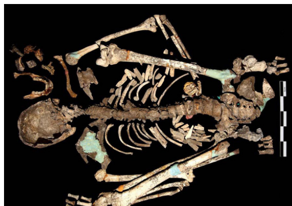
Figure 2. Fragments of Perak Man's skull and skeleton

We chose to perform a similar facial reconstruction of Perak Man but realised that the process might be a bit more complicated since the skull bones were in fragments: the posterior portion in articulation, comprising the occipital, parts of both parietals and parts of both temporal bones; a fragment of the left side of the frontal bone; three fragments of the parietal bones; fragments of both zygomatic bones; maxillary fragments with three teeth; the mandible, incomplete, with a fragment of the left condylar process, as shown in Figure 2.