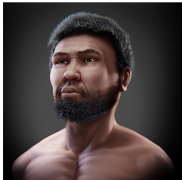
Figure 5. The hypothetical face of Perak Man

In this study, the estimated volume of Perak Man’s ICV was 1,204.91 mL, which was smaller than modern humans’ cranial capacity, as shown in Table 1.