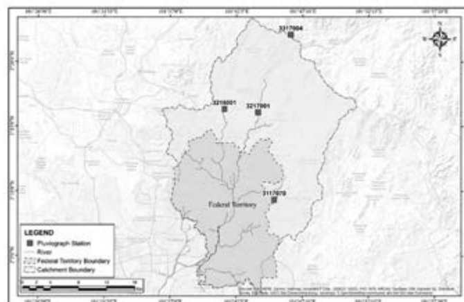
Figure 1: Locations of pluviograph stations

Pluviograph data for these stations are obtained from JPS, Ampang and were checked for consistency and completeness for this study.