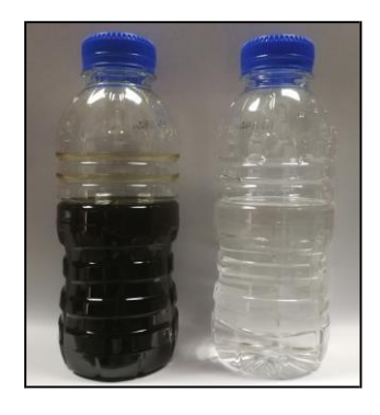
Fig. 1 Hydrothermal treatment utilization

Fig. 1 shows the laboratory-scale experiment for hydrothermal treatment utilization. The technology will employ the combination of heat energy and water, as a media to convert unutilized resources in various shapes and characteristics into a uniform product. A 150 ml of raw MSW leachate was placed into a reactor, the reactor was sealed and purged with nitrogen gas. Saturated steam about 150 °C temperature and 0.5 MPa pressure was injected to the leachate in the reactor. The reactor was heated at a 2-hours holding time after reaching all the setup condition. In the reactor, heat energy and pressure within the steam reacted to destroy the bonding of organic component in the MSW leachate to become clean water. Inorganic particles in the reactor was discharged and finally, clean water was collected from condenser as product of the hydrothermal treatment process.