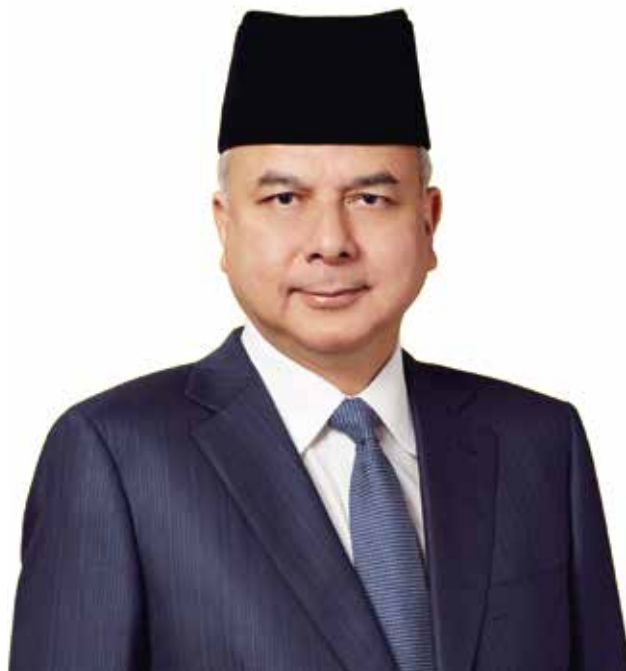
Sultan Nazrin Muizzuddin Shah ibni Almarhum Sultan Azlan Muhibbuddin Shah

His Royal Highness Paduka Seri Sultan Perak Darul Ridzuan