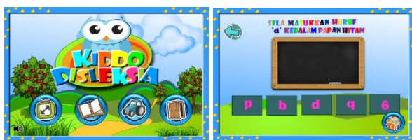
Figure 2: Kiddo Disleksia Interface Design

Letter identification is the first step for dyslexic student before they begin to read and write. The skill requires the children to recognize, memorize and repeat the process again, again and again. Kiddo Disleksia employs multimedia element such text, graphic audio and animation in letter identification and phonic blended with multisensory approach. Gamification Based Learning is used as approach to ensure student able to play without any feel being screening. The students require to play alphabet games to distinguish the alphabet based on screen. With game based approach, student more concentrate and less pressure during the screen test.