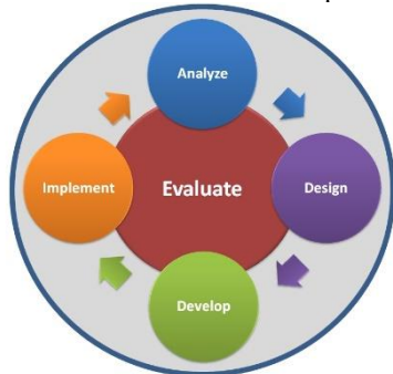
Figure 1: Addie Model

show Addie model for software development