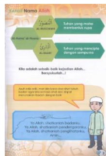
Figure. 3: The topic relates the attributes of Allah as a foundation in understanding the reality that He is the real Creator of al-makhluk .

The topic explains two attributes of Allah with regard to His ability to create the creatures in the best manner including His attributes as a Shaper ( al-mu'awwir ) and The Initiator/ Revolver ( al-b'eri ). Apart from explaining the aqidah part, it also include a du'a for every Muslims to practice it for the purpose of gaining a healthy body to perform worship to Allah.