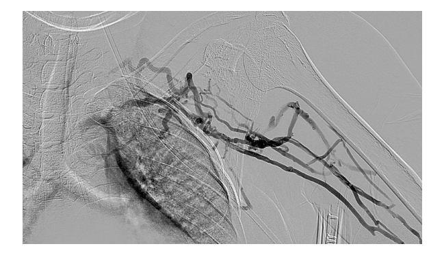
Figure 4: Left upper limb venogram showing central vein stenosis with collateral formation.