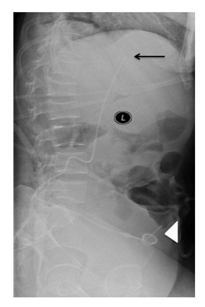
Figure 2: Lateral radiograph showing the translumbar chemoport. The tip of the catheter is near the cavaatrial junction (black arrow), and the subcutaneous port is seen anterolaterally (white arrowhead).