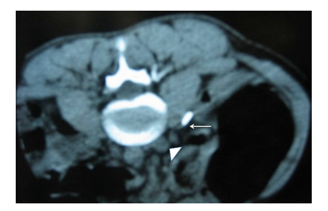
Figure 1: Computed tomography fluoroscopy showing the puncture needle (white arrow) approaching the infrarenal inferior vena cava (white arrowhead).

With the guide wire placed within the IVC, the tract was progressively dilated. A 10 Fr, 16 cm peel-away vascular sheath, which was part of the set, was inserted. For an ideal translumbar catheter insertion, a separate peel-away sheath with a recommended length between 18 and 20 cm is needed given the distance between the tissue and the entry site. However, this was not available at the time of the procedure. The peel-away sheath facilitated the insertion of the catheter into the IVC after catheter measurement was performed. The peel-away sheath was removed, and the final position of the catheter tip was confirmed with CT fluoroscopy. The proximal end of the catheter was then attached to the port and anchored to the adjacent muscle layer. The incision was closed with double-layer absorbable sutures. Similarly, the entry site was also sutured (Figure 2).