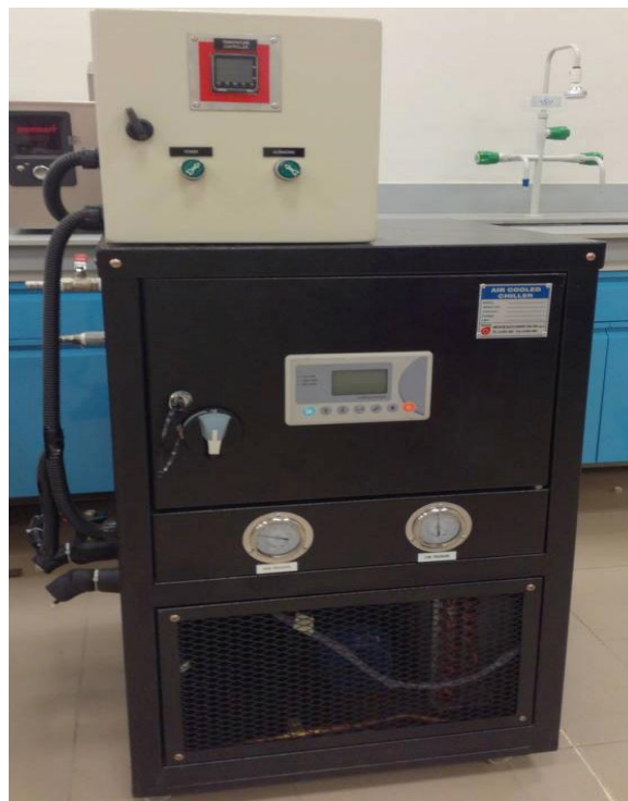
Figure 2 Finished Prototype