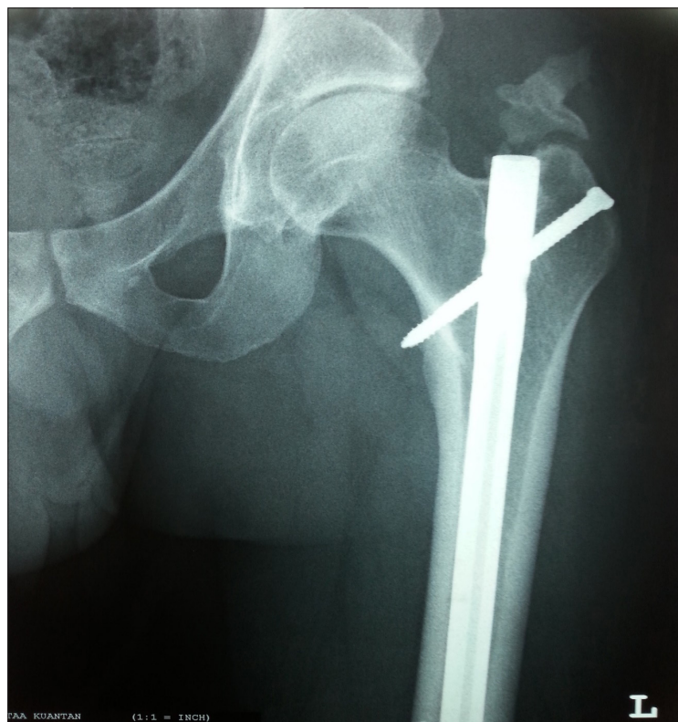
Figure 2: The radiograph of the left hip 13 months posts reamed intramedullary nail. There is a well-demarcated lesion superior to the left greater trochanter indicating heterotopic ossification at the left hip (arrow).