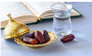
Ramadan Mubarak! Fresh Ramadan Content Every Day