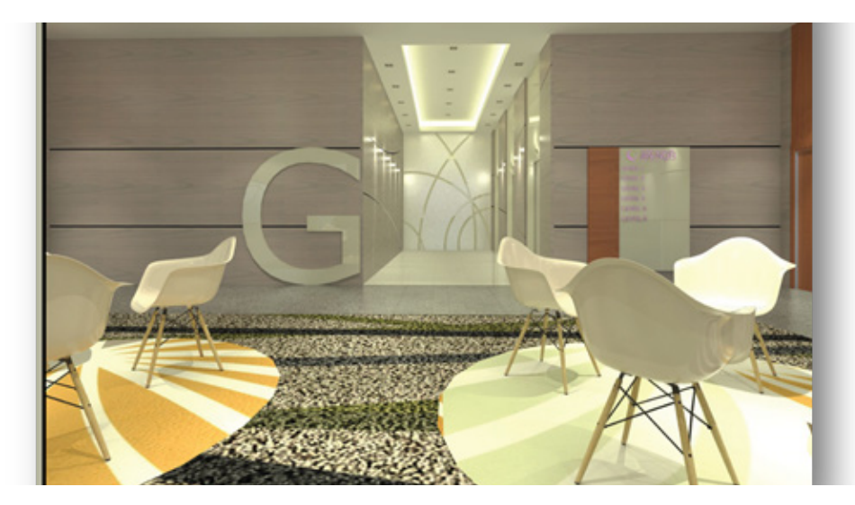
Figure 9 Main Lobby