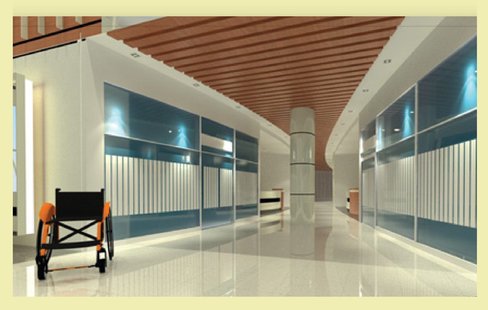
Figure 7 Hall way to café area