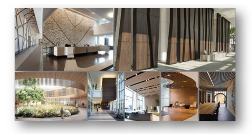
Figure 8 Mood Board and Proposal of Material Selection