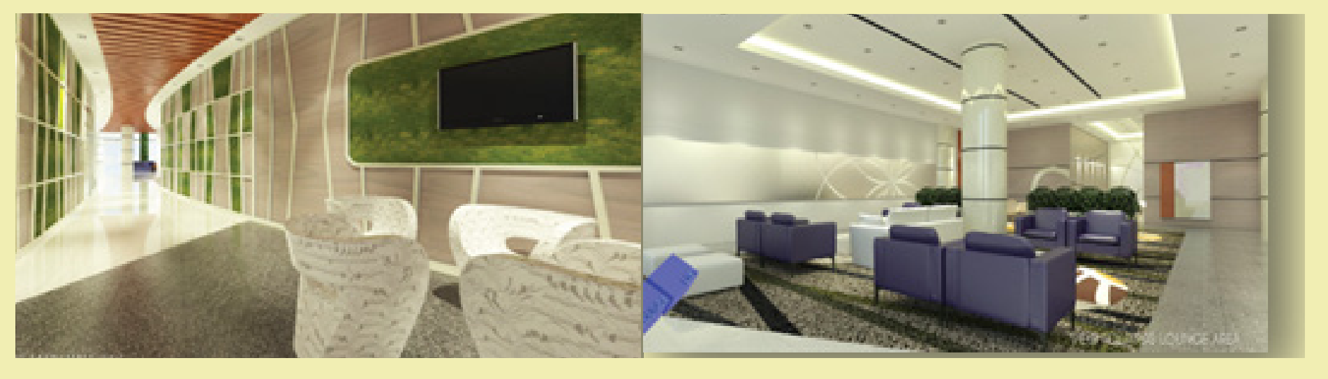
Figure 5 Corridor and lounge area with implemented of natural element