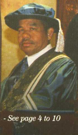
- See page 4 to 10

3 IIUM Will Open Its Fourth Campus In Pagoh