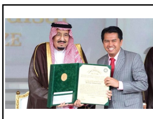
IIUM Professor among Five Recipients of King Faisal International Prize 2018