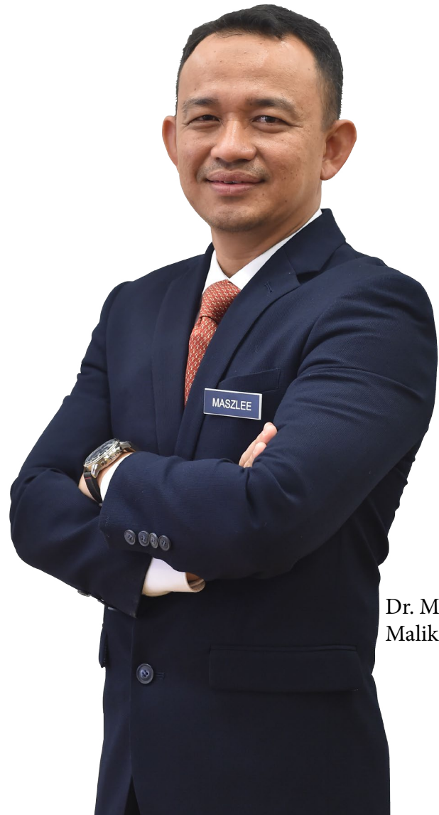
Dr. Maszlee Malik

Dr. Maszlee exemplifies a wonderful combination of Islamic and Western knowledge systems. He earned his first degree in Islamic jurisprudence from Jordan's Al al-Bayt University (AABU), and then pursued a master's programme at Universiti Malaya (the University of Malaya) in Fiqh (Islamic Jurisprudence) and Usul al-Fiqh (Principles of Islamic Jurisprudence). Finally, he received further education from the West and obtained a PhD in Political Science on the topic of Good Governance from Durham University. In that sense, he also embodies an important aspect of the vision and mission of IIUM that aims to produce scholars conversant with both