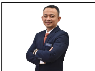
IIUM's Dr. Maszlee Malik Becomes Malaysia's Education Minister