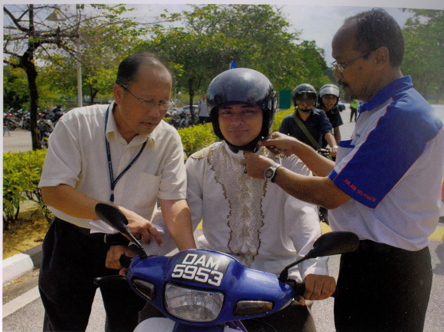
By Roslan Rusly

To create awareness on road safety, the Occupational Safety and Health Unit (OSHU) International Islamic University Malaysia (IIUM) together with the Road Safety Department (RSD) of Selangor conducted a road safety campaign in IIUM Gombak recently.