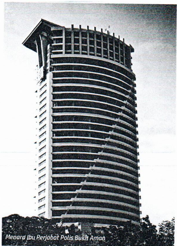
Menara Ibu Perjabat Polis Bukit Aman

Lastly, vicarious liability has to be pleaded in order for it to be relied upon. In the absence of such pleading, a defendant in a civil action cannot be held liable for damage caused by the act or omission of the defendant's subcontractor.