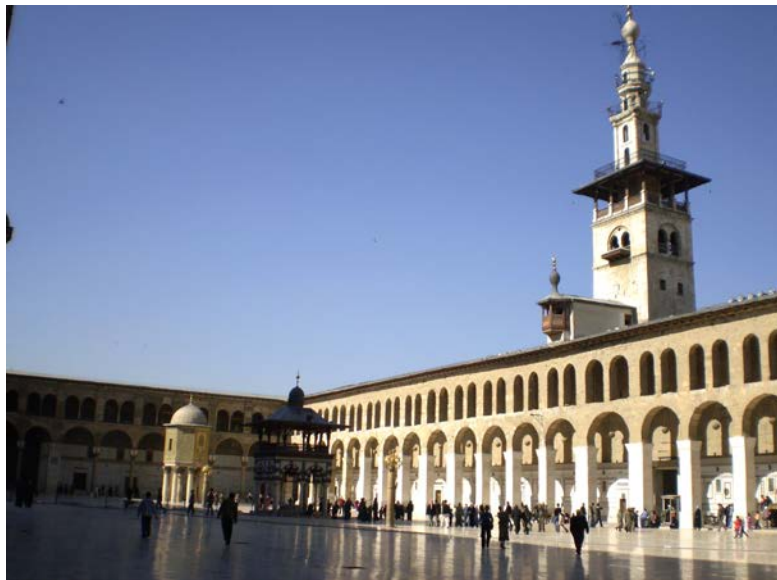
Figure 3. The courtyard of the Great Umayyad Mosque in Damascus, Syria. At the site of the Mosque, there was a temple in both the Aramaean and Roman eras. The place was later converted into a Church dedicated to St John the Baptist in the Byzantine era. Following the arrival of Muslims, the Church was eventually adopted and modified as a mosque