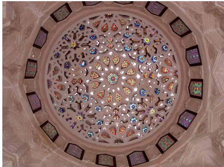
Figure 8. A number of decorative motifs adorn the interior of a dome that crowns a pavilion next to al-Suhaymi House in Cairo, Egypt