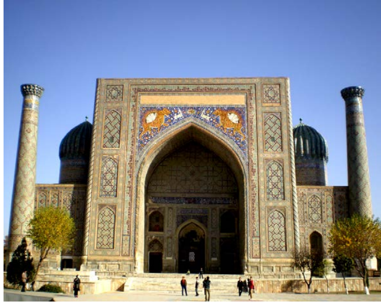
Figure 6. Sherdar Madrasah or School in Samarkand, Uzbekistan. The Madrasah is utterly decorated with various decorative themes and styles

Khaldun (1987) naturally concluded, "Thus, the walls come to look like colourful flower beds".