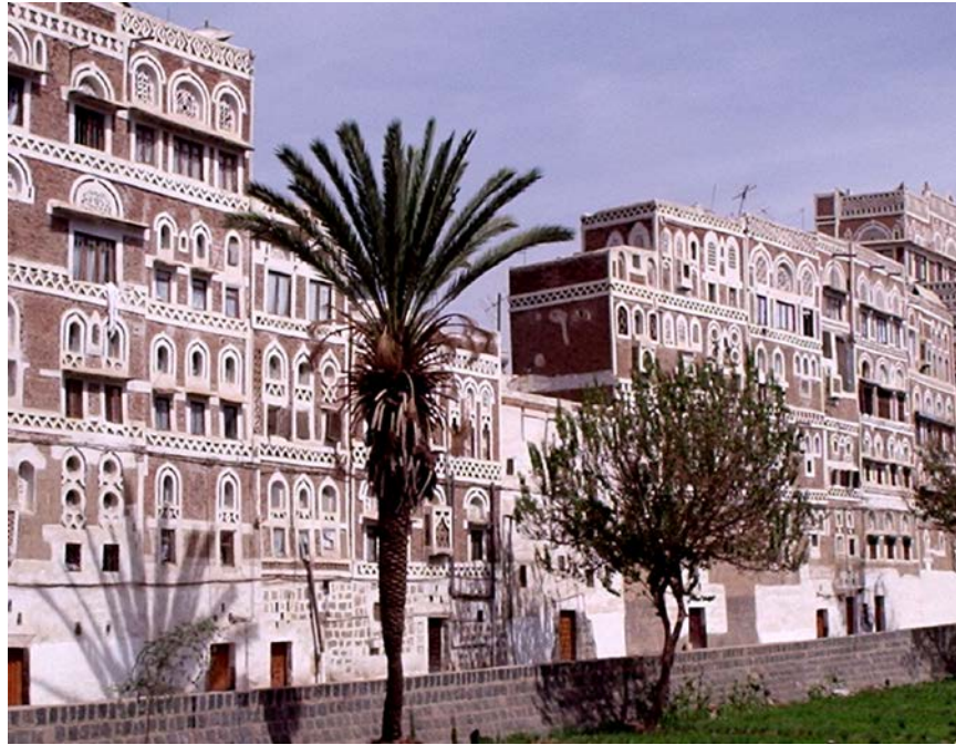
Figure 10. Richly decorated houses in Sana'a, Yemen. In terms of decoration, virtually all buildings in much of Yemen: private or public, religious or worldly, receive the same treatment, with minor contextual and typological variations