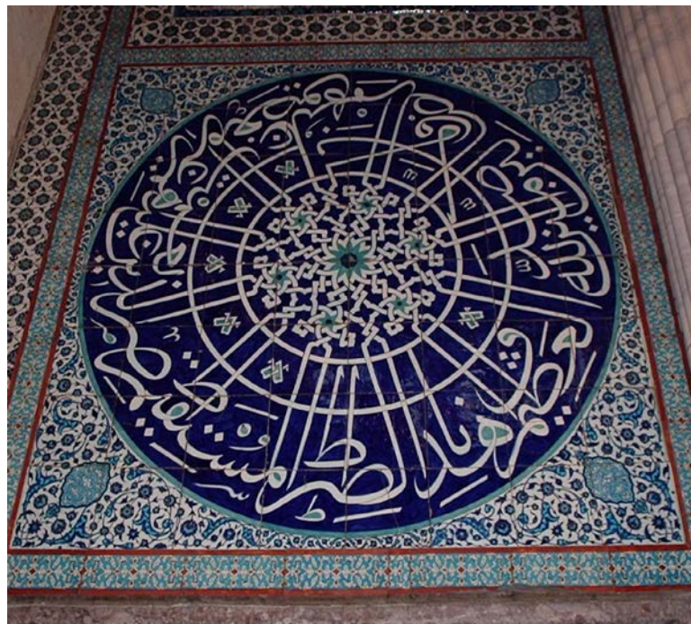
Figure 9. Calligraphy and arabesque in tile-work in the Mosque of Mehmet Pasha Sokullu in Istanbul, Turkey