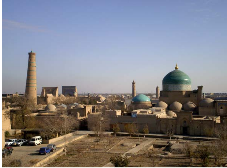
Figure 2. The skyline of the city of Khiva, Uzbekistan