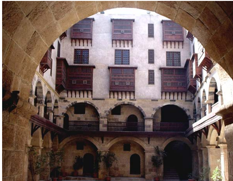
Figure 5. Al-Kekhia Caravanserai in Cairo, Egypt. The interplay of the private and public domains in the building is instantly recognisable