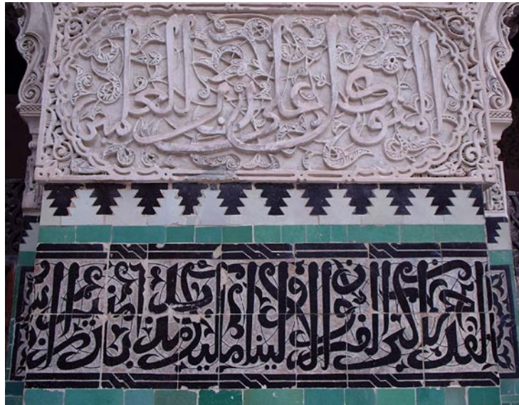
Figure 7. Two calligraphic inscriptions in contrasting styles on the façade of Bouinania Madrasah or School in Fez, Morocco