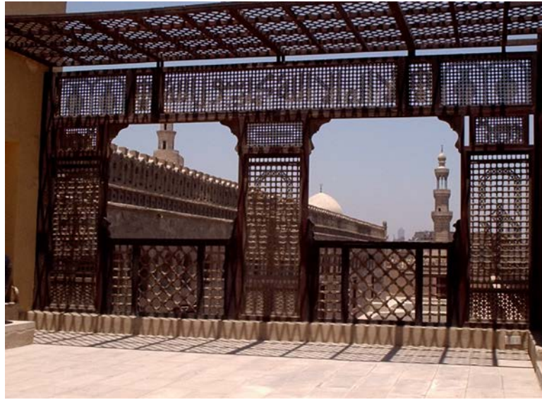
Figure 4. View of the mosque of Ahmad b. Tulun in Cairo, Egypt, through a screen on the roof of a nearby Mamluki house