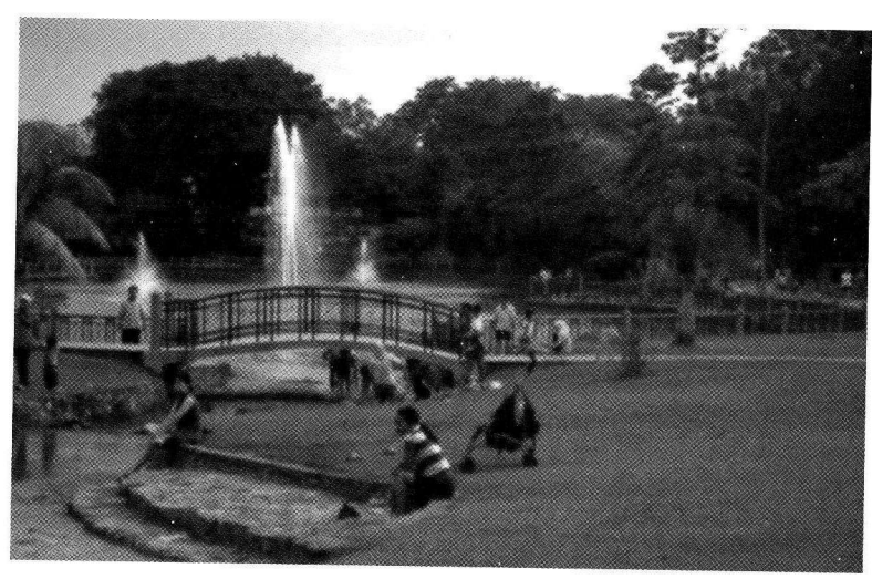
Figure 2.3: Outdoor Recreation was Proven to Improve Quality of Life (Taman Bukit Kiara, Malaysia, 2008)

the household, the value its user places upon the open space area, the presence within the household of recreational interests that may be accommodated in the open space, and probably the size and configuration of the plot area.