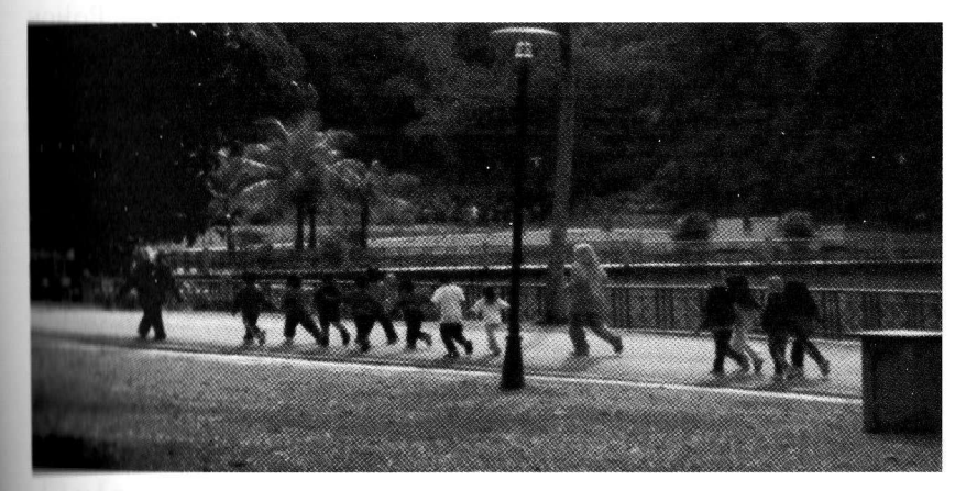
Figure 2.6: Neighborhood Park Intended to Provide a Passive and Active Recreation for the Community, Usually for Non-Organised Activities (Author, 2008)

The implementation of recreation policy according to Stewart, Parry and Glover (2008) shifts the responsibility for social and human welfares to individuals themselves. They cite examples such as the Active Living policies (see www.activeliving.org) which have been designed to promote physically active lifestyles among people. The Active Living policies have been intended to promote a social agenda of preventative health and adopted widely across North America as public health initiatives to combat obesity, sedentary lifestyles, and stress. Parks and recreation are considered significant platform in targeting individuals to achieve broader physical activity change in their lifestyles (Stewart et al., 2008).