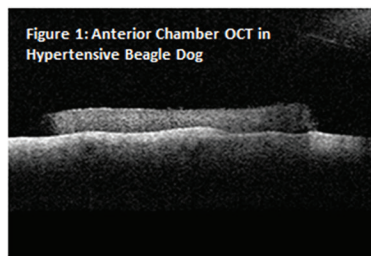
Figure 1: Anterior Chamber OCT in Hypertensive Beagle Dog

Conclusions: ENV515 demonstrated robust, sustained IOP-lowering effect for 24 weeks following single implantation via intracameral injection with acceptable safety and tolerability in hypertensive and normotensive Beagle dogs. ENV515 preclinical safety and tolerability profile supports advancing ENV515 into clinical studies in glaucoma patients.