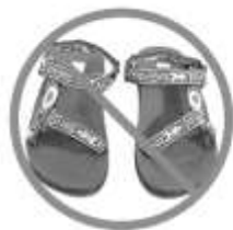
Sandals or Slippers

Participants are requested to arrive in a timely fashion for all addresses, whether to their own, or to those of other presenters. Presenters are reminded that the time slots should be divided fairly and equally between the number of presentations, and that they should not overrun. The session chair is asked to assume this timekeeping role.