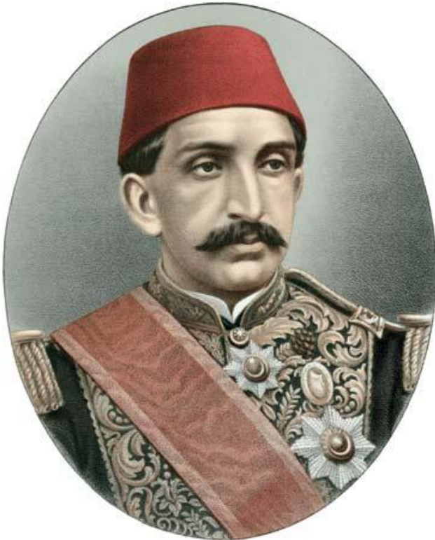
Abdulhamid II. Removed from the throne 1908