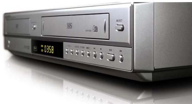
Figure 4: VHS Tape Player (VCR)

landmark case in 1984 which established video recorder owners' right to tape films broadcast on TV. Instead, the VCR created a huge new market for video sale and rental which has remained prosperous up to this date.