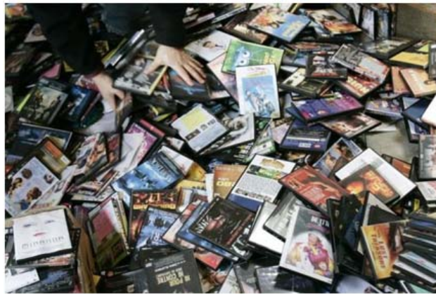
Figure 14: In Some Regions, Pirated Software Is a Way Of Life