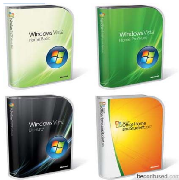
Figure 1: Microsoft Software Products

Digital piracy is heavily debated in media today. Close to all new software, music and movies are made available on the Internet by people who feel that information should be free. Piracy has been around since the dawn of software but the industry has been rather slow to react. Anti-piracy groups have been founded and funded by the manufacturers of software and digital media and they have shown quite good results when combating piracy within corporations.