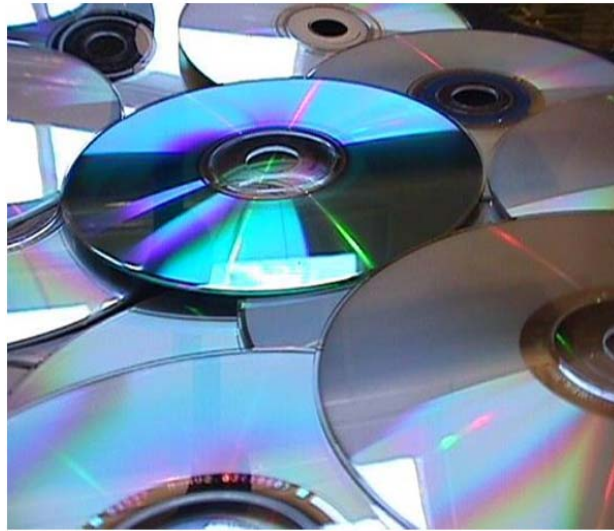
Figure 6: The Compact Disc (CD)

In the mid 1990's, CD-writers for home use started to appear and another revolution in terms of piracy began. Internet started to find its way into people's homes and MP3 songs were steadily on the move. The BBS's which earlier had served as rather local meeting places now started to transfer to the Internet to join forces with all the other BBS's. CD's were copied more and more frequently and the industry had a hard time protecting its products.