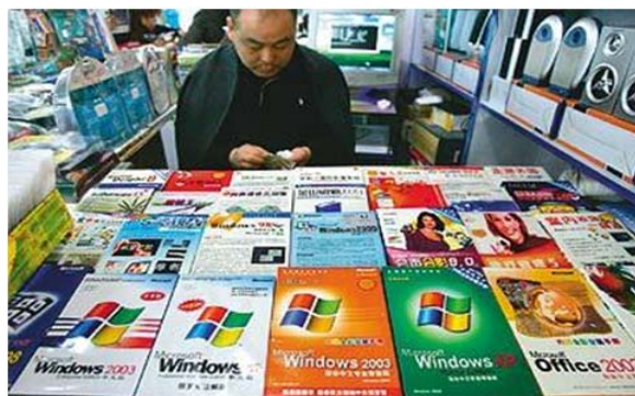
Figure 10: Pirated & Cheap Software

However, simplicity is not the only answer. Inadequate copyright laws, lack of government commitment to enforcement, and unfamiliarity with the advantages of original software use are among the factors contributing to the high rates of software piracy around the world. (Software piracy not only denies the software developer its rightful revenue, it also harms the local and national economies. Fewer legitimate software sales result in lost tax revenue and decreased employment. Software piracy greatly hinders the development of local software communities. If software publishers cannot sell their products in the legitimate market, they have no incentive to continue developing programs. Many software publishers simply won’t enter markets where the piracy rates are too high because they will not be able to recover their development costs.