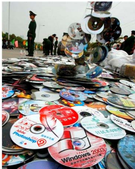
Figure 9: Pirated DVDs Prepped For Disposal

Software Piracy harms all software companies and ultimately the end-user. It results in higher prices for licensed users, reduced levels of support, reduced investment in the development of new products and a reduction in product support and training. ( Piracy is considered a living nightmare for all software publishers, regardless of their size. Software developers spend literally years developing software for the public to use. A portion of purchasing original every dollar spent in software is funneled back into research and development so that better, more advanced when software products can be produced.