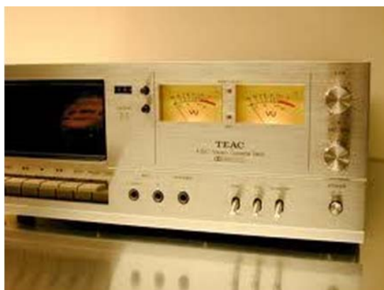
Figure 2: Cassette Deck

When personal computers made their entry on the market in the late 1970's, the notion of software was only a few years old. Therefore there was no established legislation concerning software although one could argue that the software was protected in the same way as a published entity or as intellectual property. Before the arrival of personal computers another form of piracy played a major part in society, "Bootlegging" "Copying" of records was commonplace but not in the same extent as today with CD- burners and peer-to-peer networks.