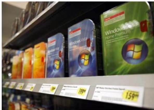
Figure 13: Original Software & High Prices Dilemma

Convenience is often a factor for individuals and organizations that will copy an application for immediate use, making the copying process more convenient than obtaining a new license. While believing this one off event will not have any ethical or financial impact, the accumulation of these events leads to severe piracy issues worldwide.