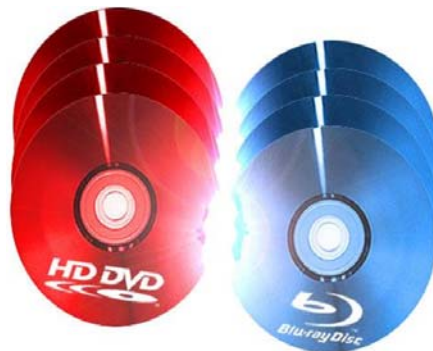
Figure 8: Digital Video Disc (DVD)

With the release of DVD-writers, copying of DVD movies has started to take off. This has opened up a new market for copy protection systems since the original scrambling system for DVD (CSS) was cracked by a Norwegian boy who wanted to create an open-source software DVD-player for Linux.