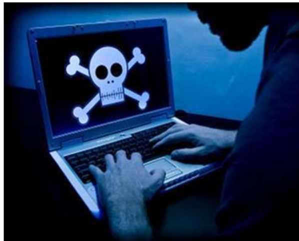
Figure 11: Crackers Can Cause Some Serious Damages

Crackers can pirate applications to steal features and include these features in their own products. Ex- employees can have issues with a specific coworker or their ex-employer and break an application, distributing the software for free or perhaps gaining notoriety themselves by damaging the credibility of the manufacturer or the application.