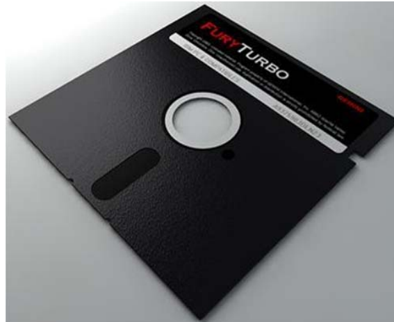
Figure 3: Early 170 KB Floppy Disk

The movie industry feared for their very existence when the VCR (Video Cassette Recorder) was first released in 1977. Many argued that this was the end for the movie industry, especially when Sony won a