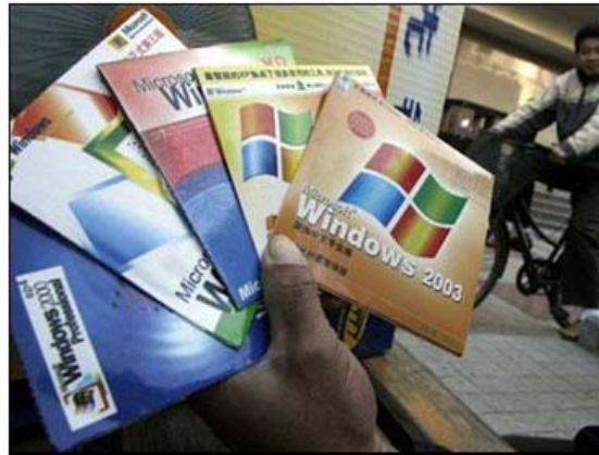
Figure 12: Pirated Software Ready for Sale

Convenience is often a factor for individuals and organizations that will copy an application for immediate use, making the copying process more convenient than obtaining a new license. While believing this one off event will not have any ethical or financial impact, the accumulation of these events leads to severe piracy issues worldwide.