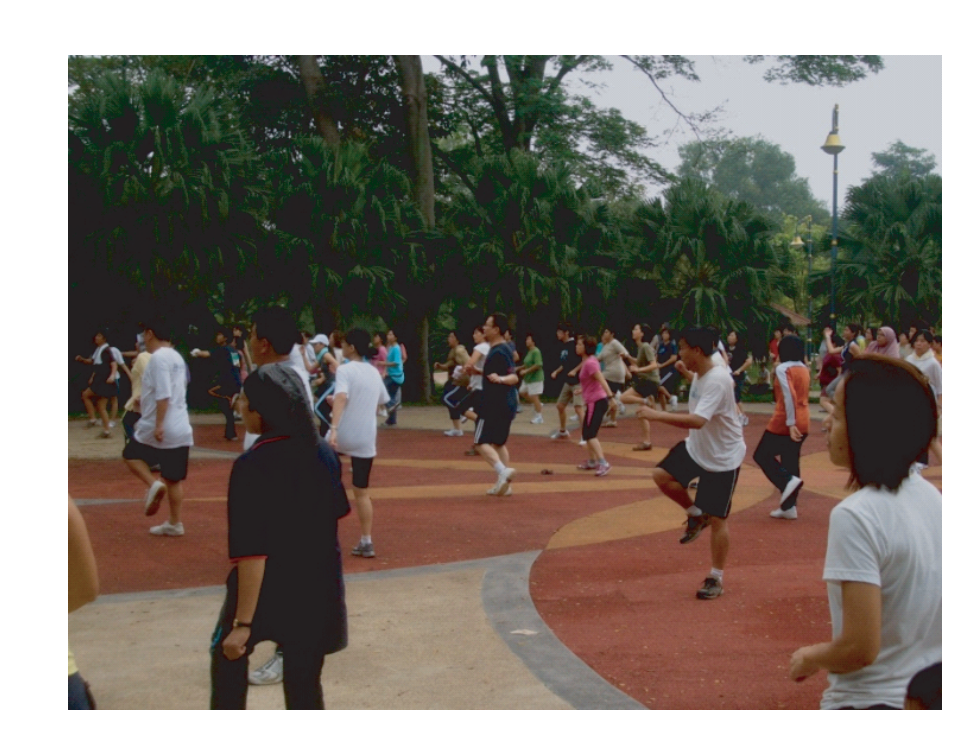
Figure 2: Some of the usual views and recreational activities including hardscapes and softscape elements found in a Malaysian neighbourhood parks. Source: Taman Tasik Menjalara & Taman Lembah Kiara, Kuala Lumpur, Author (2009).