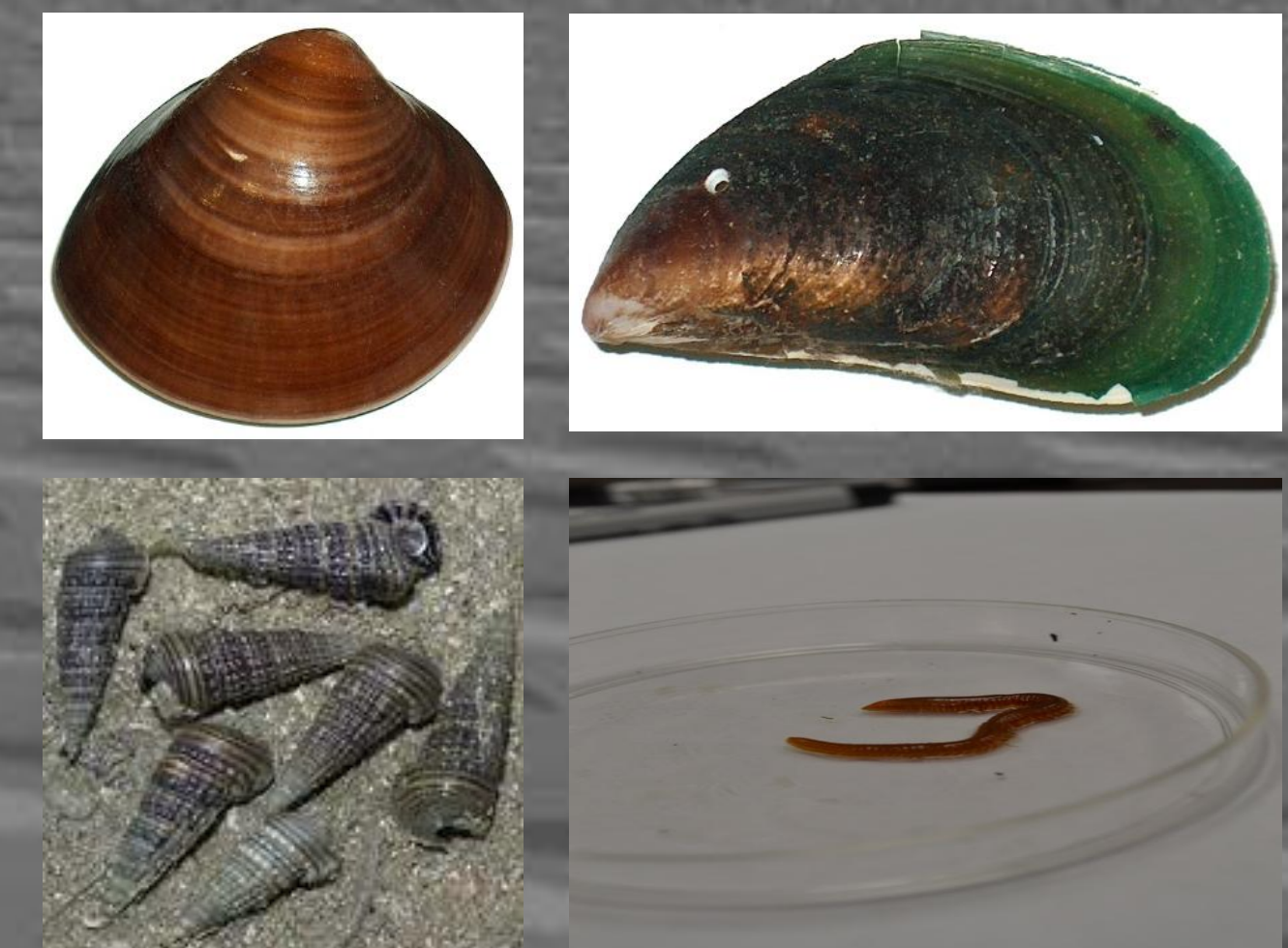
Major groups of Macrobenthos