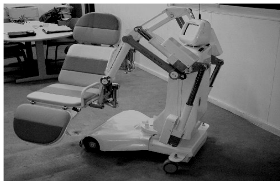
Fig. 6. Nursing Robot Regina.