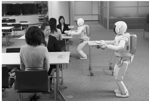
Fig. 1. Two robots work together in cooperation.

Two robots could be used to perform simple tasks like carrying, lifting or manipulate an object. They can also perform same task in certain order. In Fig. 1, two robots serve coffee to the customer.