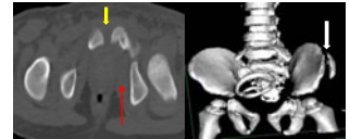
CT scan & 3D reconstruction of the pelvic bone, showed fracture of left pubic bone (white arrow) with diastasis of symphysis pubis (yellow arrow) and swollen left obturator internus muscle (red arrow). No other intra abdominal injuries were detected on CT abdomen.

A 2-year old pedestrian, hit and dragged by a lorry. He sustained degloving injury of right thigh which extend to right iliac fossa and closed fracture of left iliac crest & left superior pubic ramus. He was unable to pass urine since the accident and suprapubic catheter was inserted. Two days later he had haematuria and CT scan was performed to rule out genitourinary tract injury.