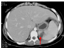
CT scan showed haematoma in the spleen parenchyma (arrow) with no disruption of its outline. No perisplenic blood collection. At lower scan (images not shown) there was minimal blood collection in the pelvis.

Two days later she presented again with abdominal pain, diarrhoea and vomiting. She was admitted with clinical impression of dehydration secondary to acute gastroenteritis. However, blood investigation showed a drop in haemoglobin level that raised the suspicion of intra abdominal injury.