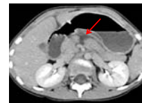
CT scan showed transection of the body of pancreas (arrow). Other organs were normal.

A 9-year old girl who fell from bicycle. Laceration wound at the forehead was sutured at a district hospital. Mother noticed a bruise on the abdomen, but she was reassured and patient was discharged home. She presented 2 days later with abdominal pain and persistent vomiting and was referred to our hospital, HTAA for further management.