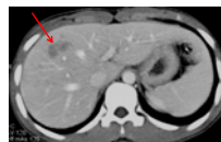
CT scan showed haematoma in the liver parenchyma (arrow). Other organs were normal.

In HTAA further examination revealed tenderness at the right hypochondrium. Haemoglobin level was normal.