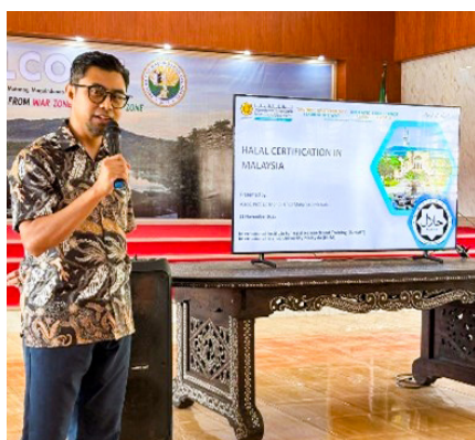
Figure 6: Empowering participants with comprehensive knowledge, INHART delivered multiple key topics on the halal industry ecosystem.