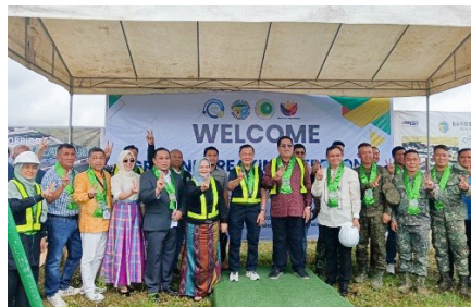
Figure 1. Groundbreaking ceremony of the WOW-Matanog Special Economic Zone, attended by local leaders, community representatives, and project stakeholders.

The event brought together international and local investors, BARMM officials, and representatives from the provincial government of Maguindanao del Norte, led by Governor Datu Tucao O. Mastura. The Local Government of Matanog, under Mayor Zohria Bansil Guro, warmly welcomed the delegation and reiterated its strong commitment to supporting the initiative.