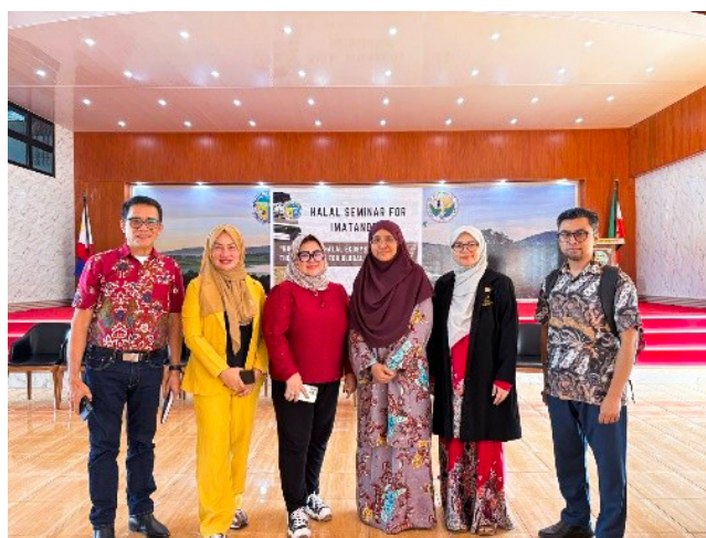
Figure 5: The Halal Seminar received overwhelming support from industry players, investors, key stakeholders, and community representatives.

She also discussed the current landscape of the halal industry in Malaysia and globally, emphasising emerging trends, market opportunities, and the growing demand for halal products and services.