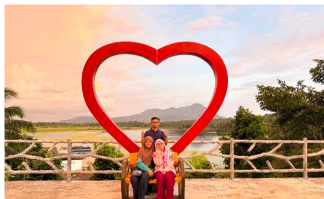
Figure 7: A serene landscape showcasing the richness of natural resources and untapped potential.

The "WOW" in the project, stand for "Woman of War", symbolising resilience, determination, and community agency in this transformative moment.