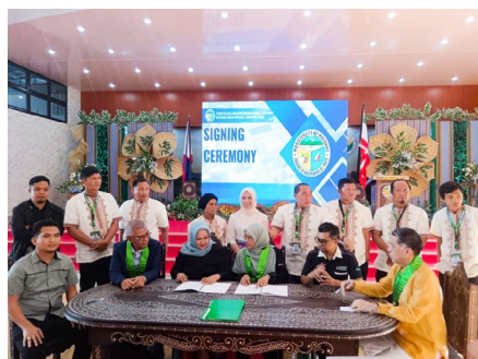
Figure 3: A meaningful partnership begins—INHART and Iranun Development Council Sign MoU to empower the Iranun community through halalan toyyiban initiatives.