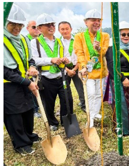
Figure 2 : Guests officiating the groundbreaking gimmick, marking the beginning of a new chapter for the project.