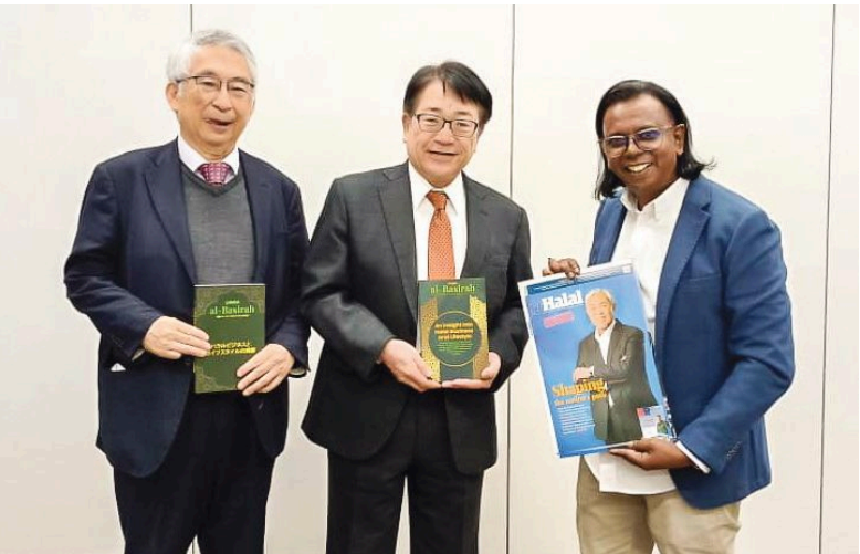
INSIGHTFUL: Expert-led seminar on Muslim-friendly hospitality.

Attended by participants from the Japanese industry players, local government and academia in Muslim Friendly Hospitality