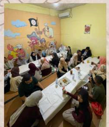
DINNER AT D'JAJAN SEAFOOD

For dinner, we enjoyed a shellout meal together at a restaurant called D'Jajan Seafood which was both filling and fun. We all sat down in the same room and ate together along with the lecturers and students from university of raharja. After a long but exciting day, we made our way back to the hotel to rest and prepare for the next day.