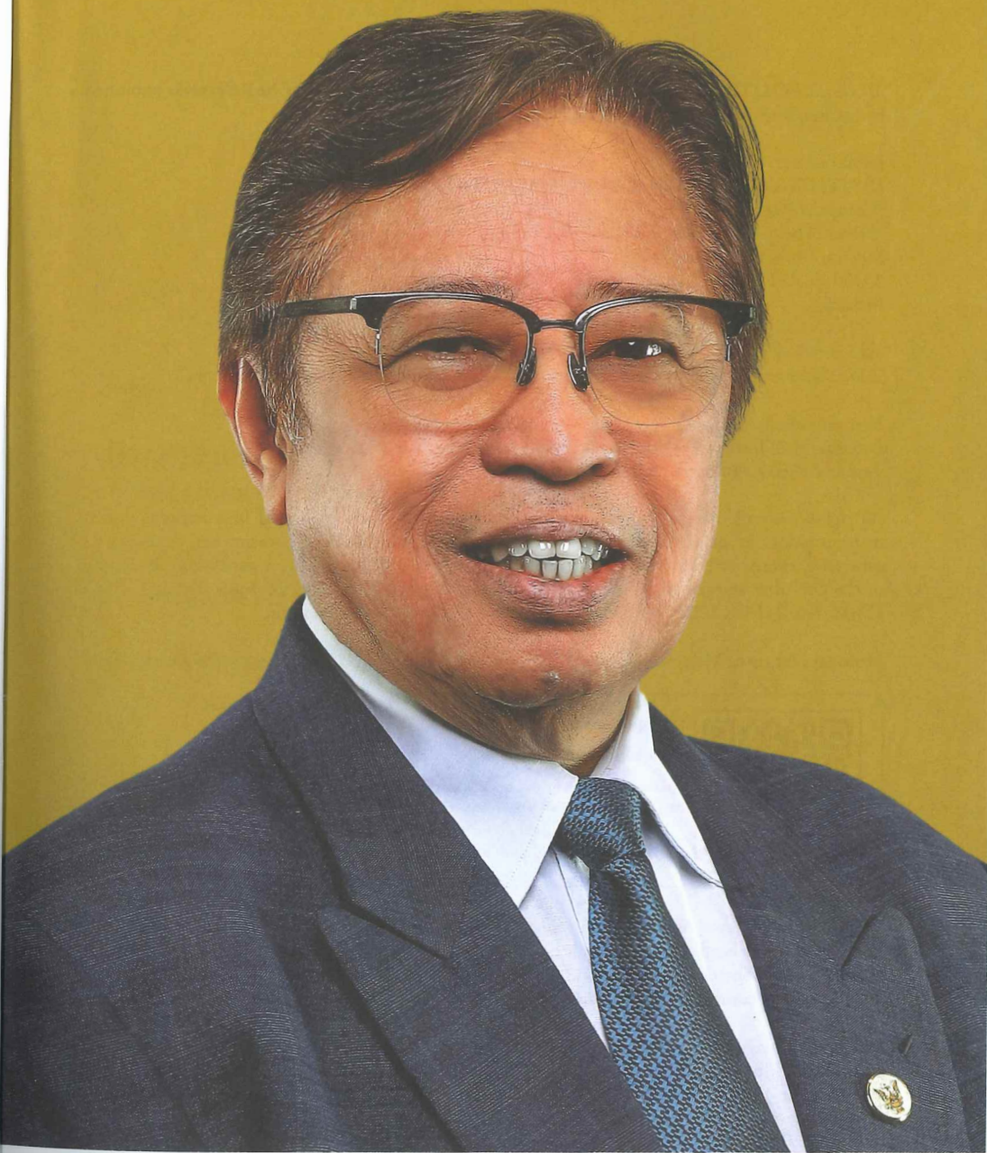
Yang Amat Berhormat Premier of Sarawak Datuk Patinggi Tan Sri Dr Abang Haji Abdul Rahman Zohari Tun Datuk Abang Haji Openg