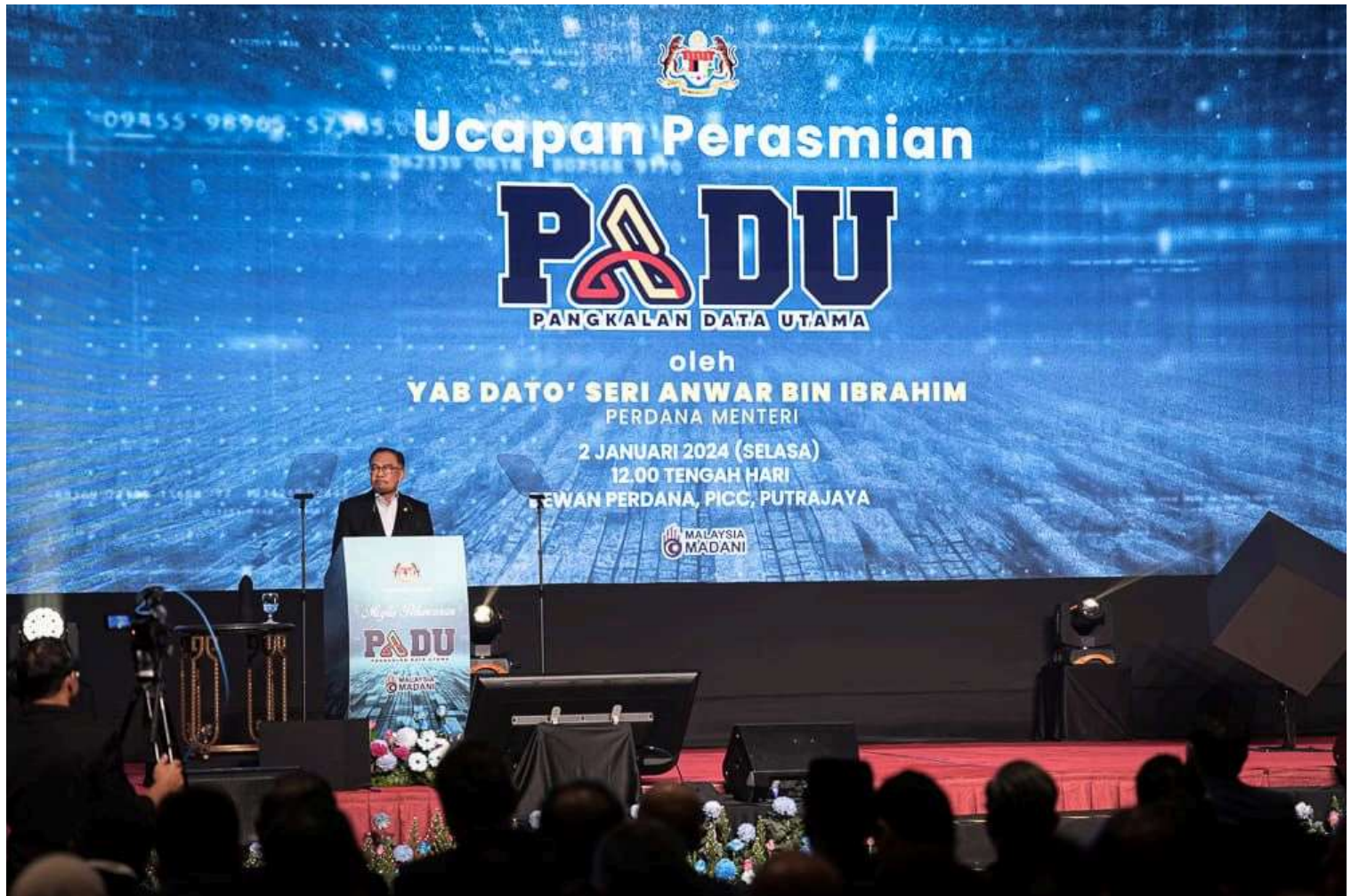
主要数据库系统 (PADU) 这个概念，从长远来看这是有必要的，可以缩短一长串官僚主义的繁文缛节。

我喜欢主要数据库系统 (PADU) 这个概念，从长远来看这是有必要的，它可以缩短一长串官僚主义的繁文缛节，最理想情况是，我们不必一次又一次地重新填写所有数据。此外，有了更精确的数据，政府可以针对性的发放补贴。