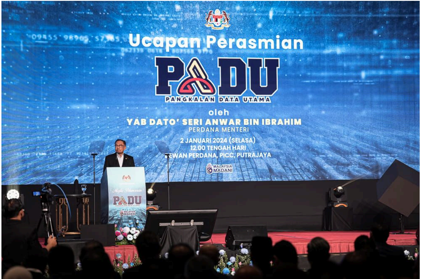
The concept of the main database system (PADU) is necessary in the long run to shorten a long series of bureaucratic red tape.

Last updated 1 year ago · Published on 11 Jan 2024 3:22PM · 0 comments