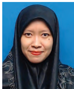
BY ANIS NAJIHA AHMAD