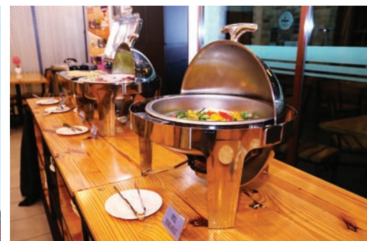
Seri Malaysia has Gurindam Ramadan as the theme of its Ramadan buffet.