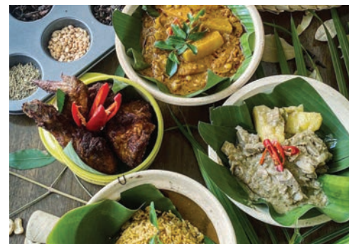
Nasi Bukhari set.