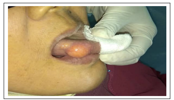
Figure 1: Two yellowish ovoid submucosal masses on the right lateral border of the tongue.

Intraorally, we noted a yellowish, smooth, sessile mass on the right lateral border of the tongue measuring about 2cm x 1.5cm x 1.5cm in size (Figure 1). Upon palpation, the mass was non-tender, non-pulsatile and was slip sign positive. Another similar featured lesion measuring 0.5cm at its longest dimension was identified posterior to the original mass. There was no generalized ulceration, bleeding, restriction in tongue movement, neurosensorial disturbances, facial swelling or regional lymphadenopathy. She was partially edentulous, retaining only two lower posterior teeth and does not use dentures. Our initial clinical impression was lipoma and an intraoral biopsy under local anaesthesia was planned. The procedure was performed by administering 2.2 ml Mepivacaine 2% with epinephrine 1:100,000 as local field block followed by a longitudinal incision at the lateral tongue edge (Figure 2).