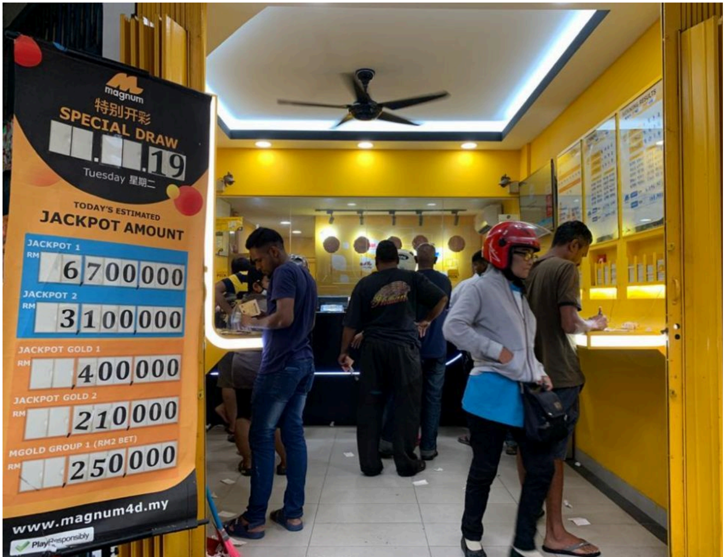
Even though the PAS-led state governments have closed lottery betting stations, residents of these states can still travel to other states to buy lottery tickets.

For example, in the United States, the minimum RTP must be 80%, and in reality it is usually higher due to competition. In the UK, although there is no legal minimum RTP requirement, casinos must clearly publish the RTP to allow players to self-assess whether the odds are reasonable. Unfortunately, in Malaysia, there is no minimum RTP requirement and no regulations requiring the publication of RTP.