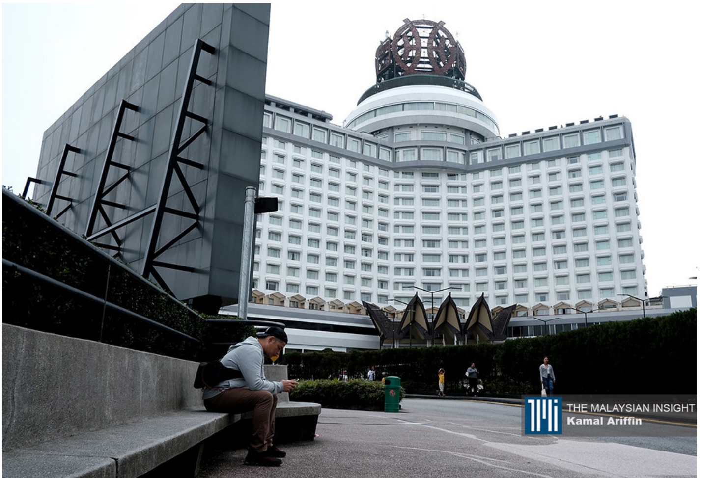
At Genting Casino, for their slot machines, do you know the odds, or in more technical terms, the return to player (RTP)?

I would like to state my position before this discussion, which is either to approve the second casino license or to control the existing license.