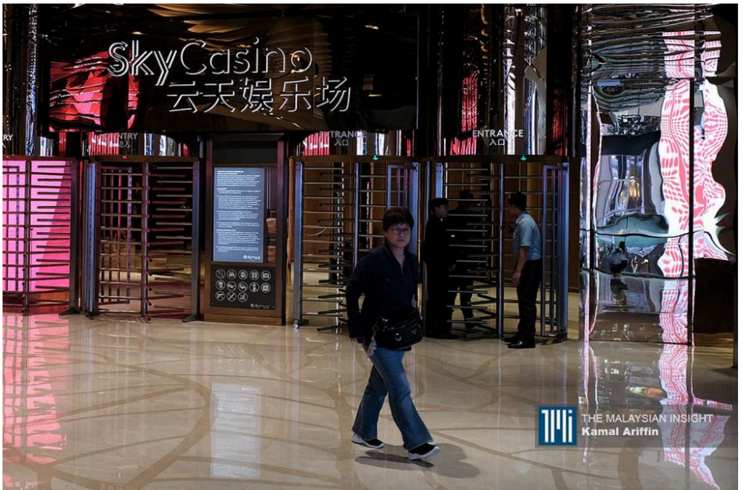
My ideal proposal is to approve a second casino license, like Singapore, to let the market regulate itself.

Last updated 7 months ago · Published on 2 Nov 2023 2:11PM · 0 comments