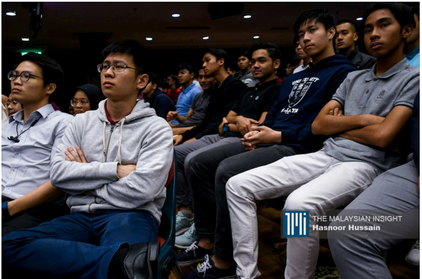
Budget 2024 will surely have a lot of goodies for students in public universities, with other additional benefits and privileges.

Any government promises to carry out salary revisions but as of now, there has been no actual progress. I can understand this because a revision of civil servants' salaries means that the government has to pay civil servants more consistently. It is not a one-time thing but a fixed increase in operating expenses every year thereafter. Hence, salary revisions have been promised repeatedly since the Najib era until now. Civil servants may not trust Anwar easily and this RM2,000 bonus is a hint of his determination in salary revisions.