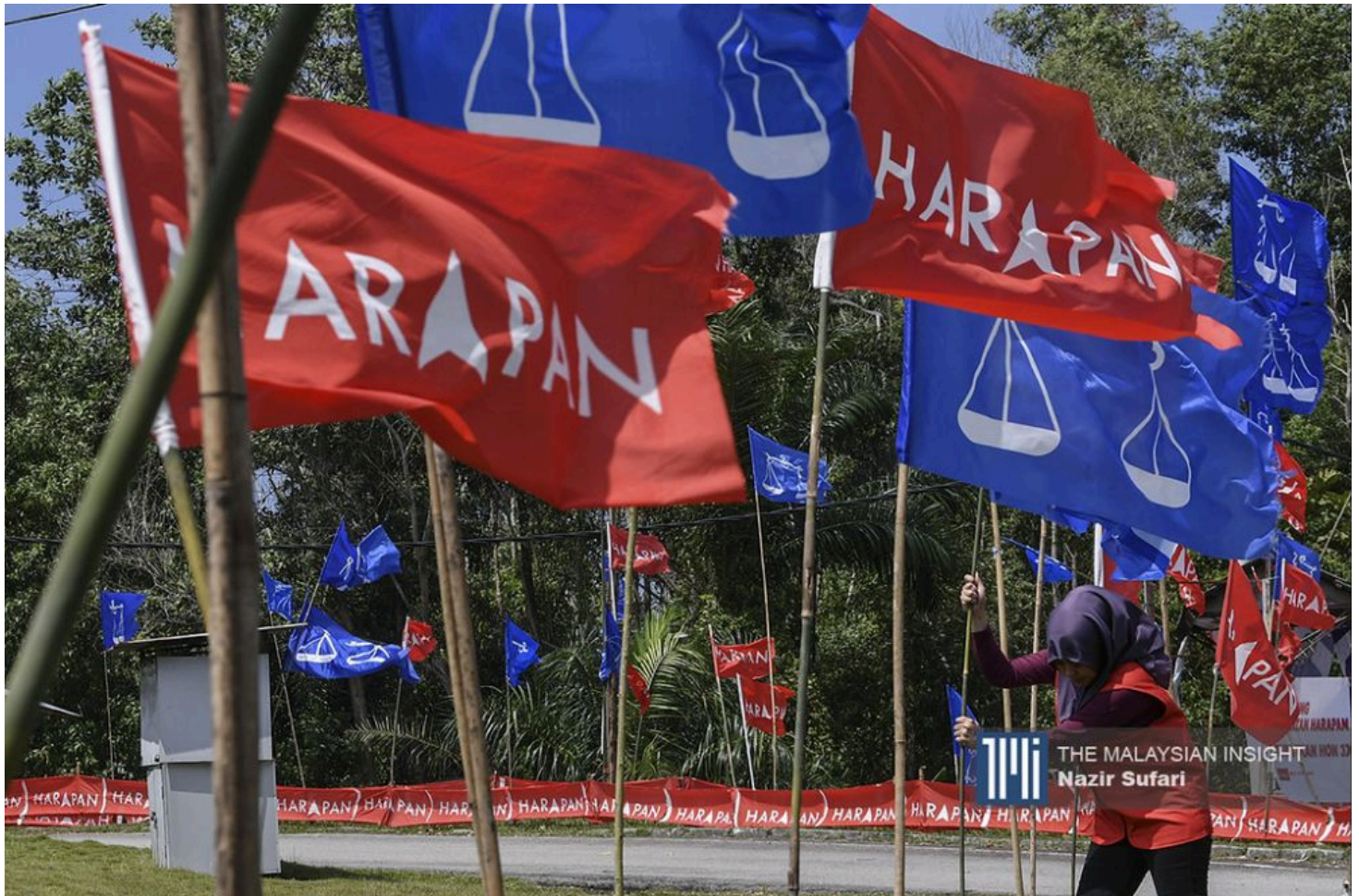
The author believes that UMNO really needs to rethink their direction after these by-elections if supporters withdraw their support for UMNO and there is a risk of being ousted by PH in the future.

Last updated 8 months ago · Published on 5 Oct 2023 2:12PM · 0 comments