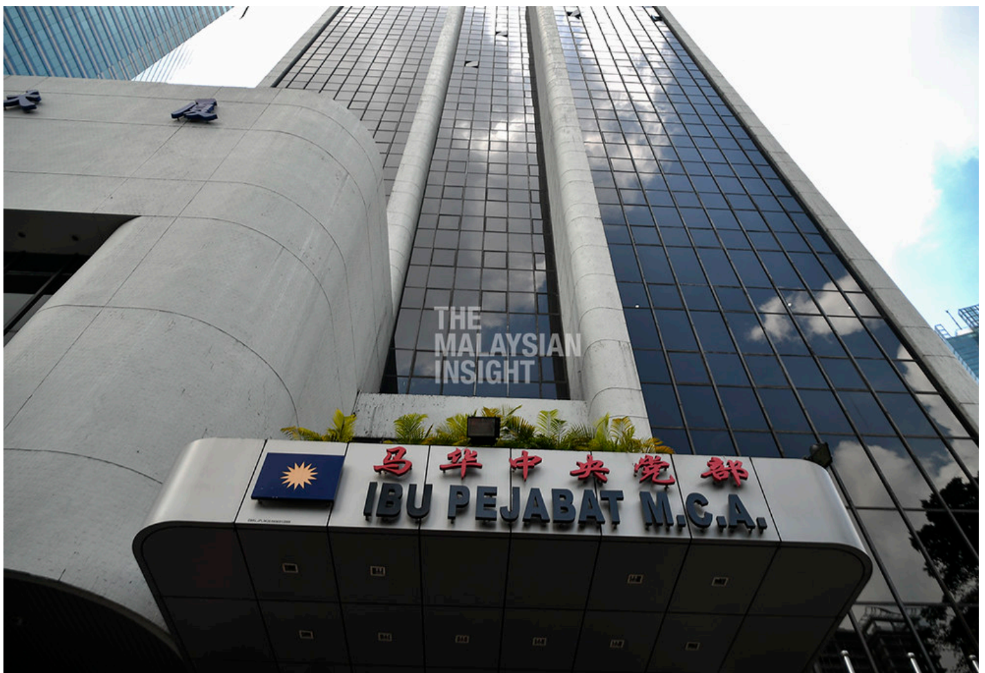
MCA and MIC have been trying for 15 years but still cannot win back the support of the Chinese and Indian communities.

In politics, facts are often secondary, while feelings and opinions are primary. Although these feelings and opinions may not be correct, they will affect the key points of voting tendencies.