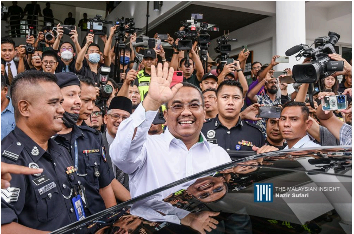
Kedah Chief Minister Mohamad Sanusi was previously in the spotlight because he was in charge of eight affairs committees.

Last updated 9 months ago · Published on 24 Aug 2023 2:21PM · 0 comments