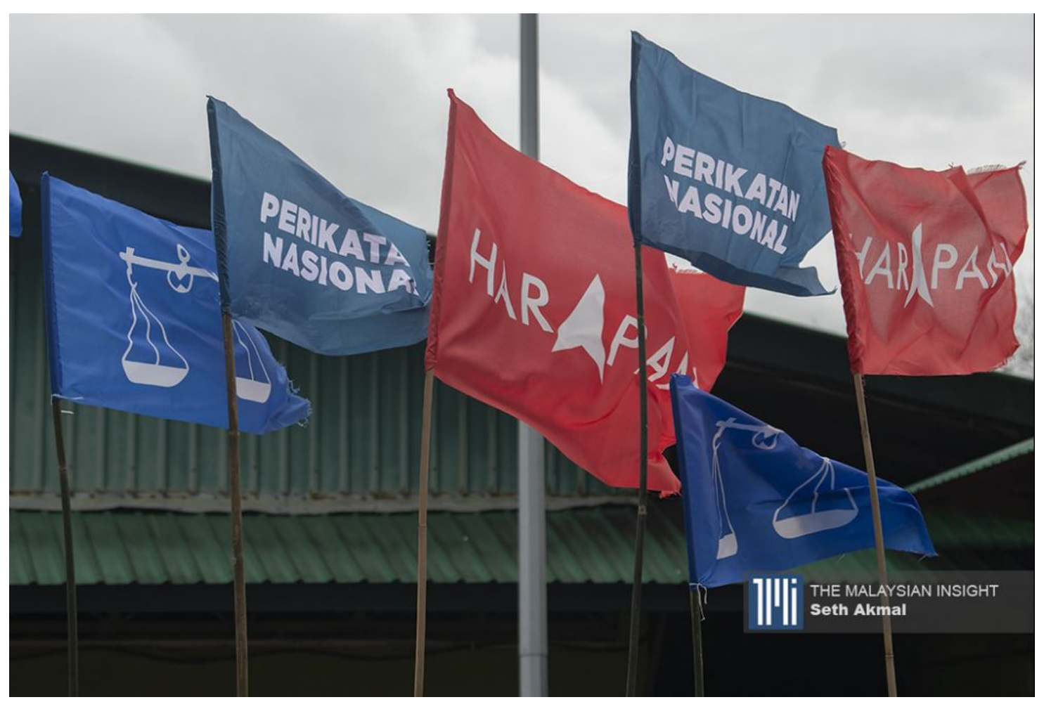
The author believes that PN will win Kelantan, Terengganu and Kedah, while PH and BN will win Penang, Selangor and Negeri Sembilan.

Last updated 10 months ago \cdot Published on 27 Jul 2023 2:00PM \cdot 0 comments