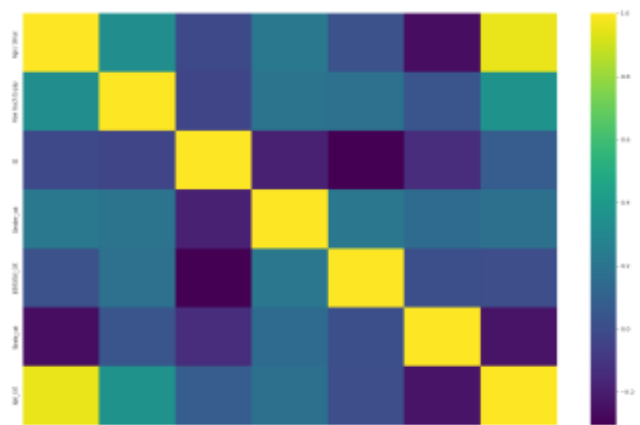
Fig. 1 Correlation Matrix for survey dataset

Figure 1 shows us that the datasets are not really correlated with each other but still, the data can be used for predictive analysis. The datasets only have below 0.6 correlation value as the highest most correlated in the datasets which are not very good or very bad.